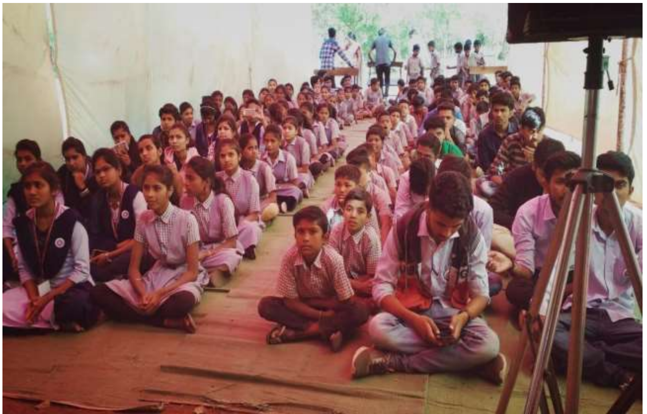
NSS Volunteers & School students participated in Motivational Program