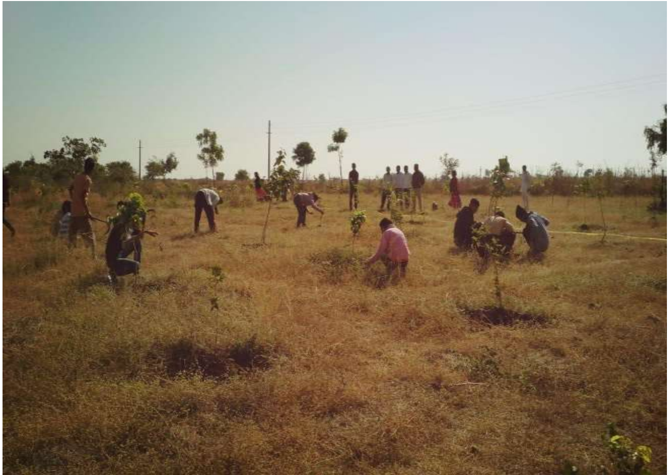
NSS Volunteers performing Shramdan at Project Site