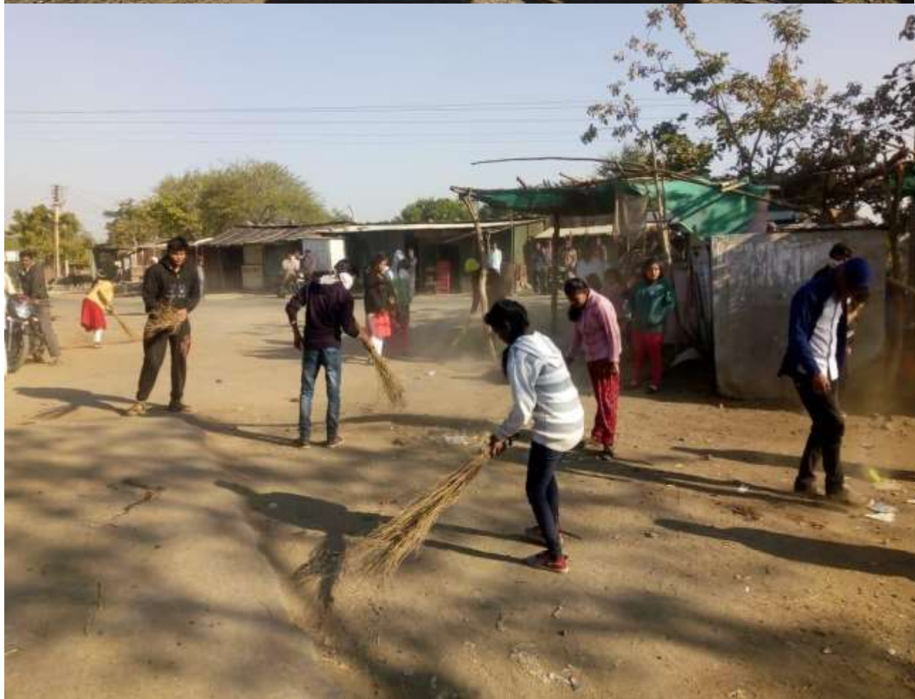
NSS Volunteers participating in Shramdan at Village