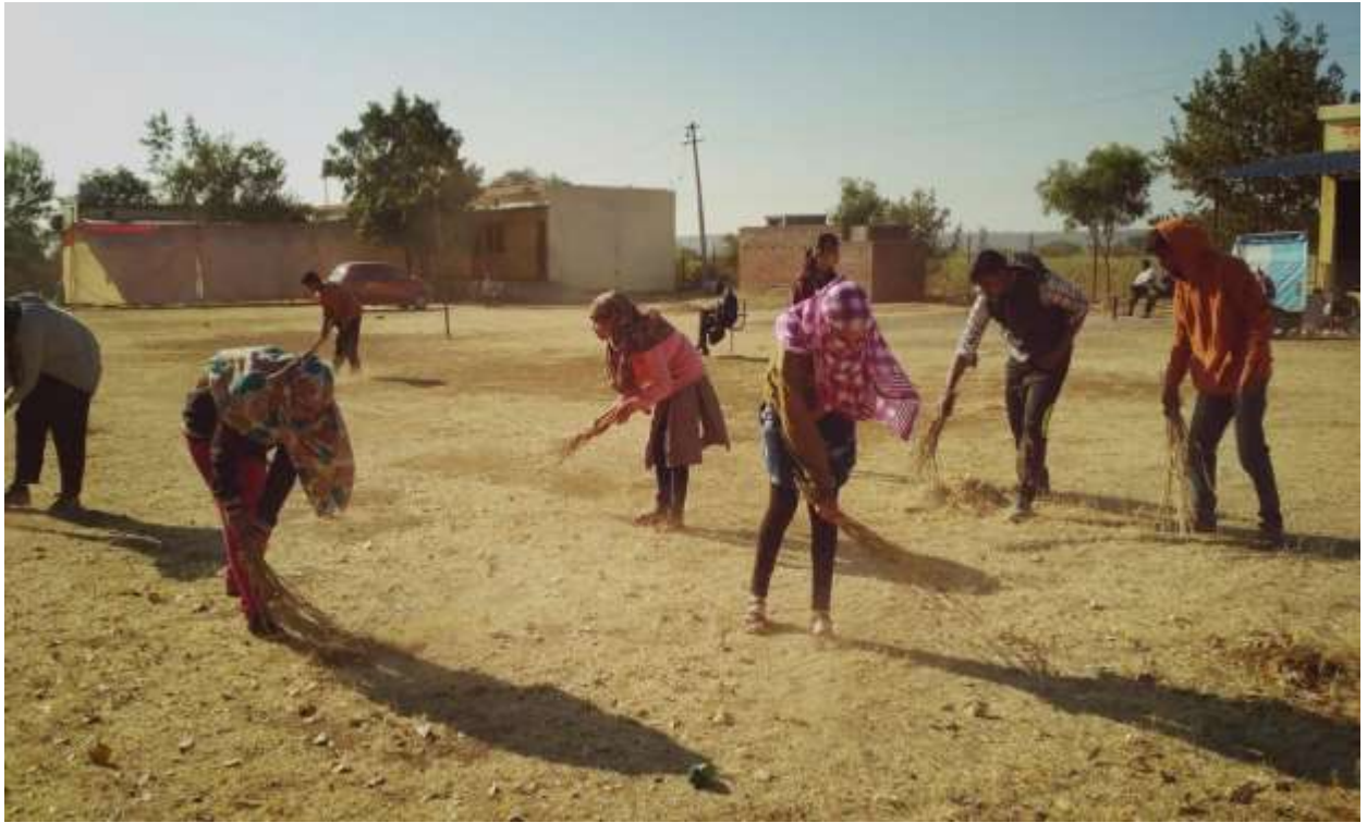
NSS Volunteers participated in Cleaning of the Camp Area