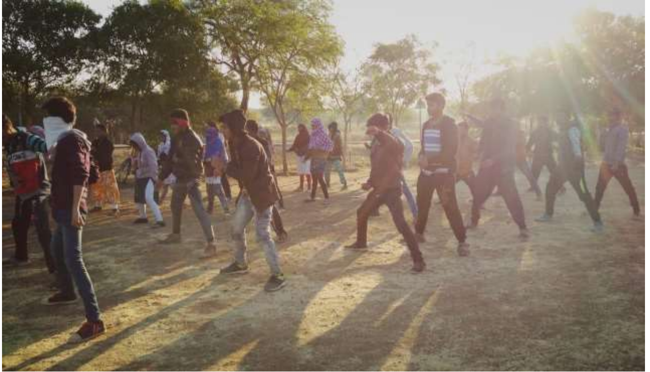
NSS Volunteers participating in Prayer, Exercise and Yoga