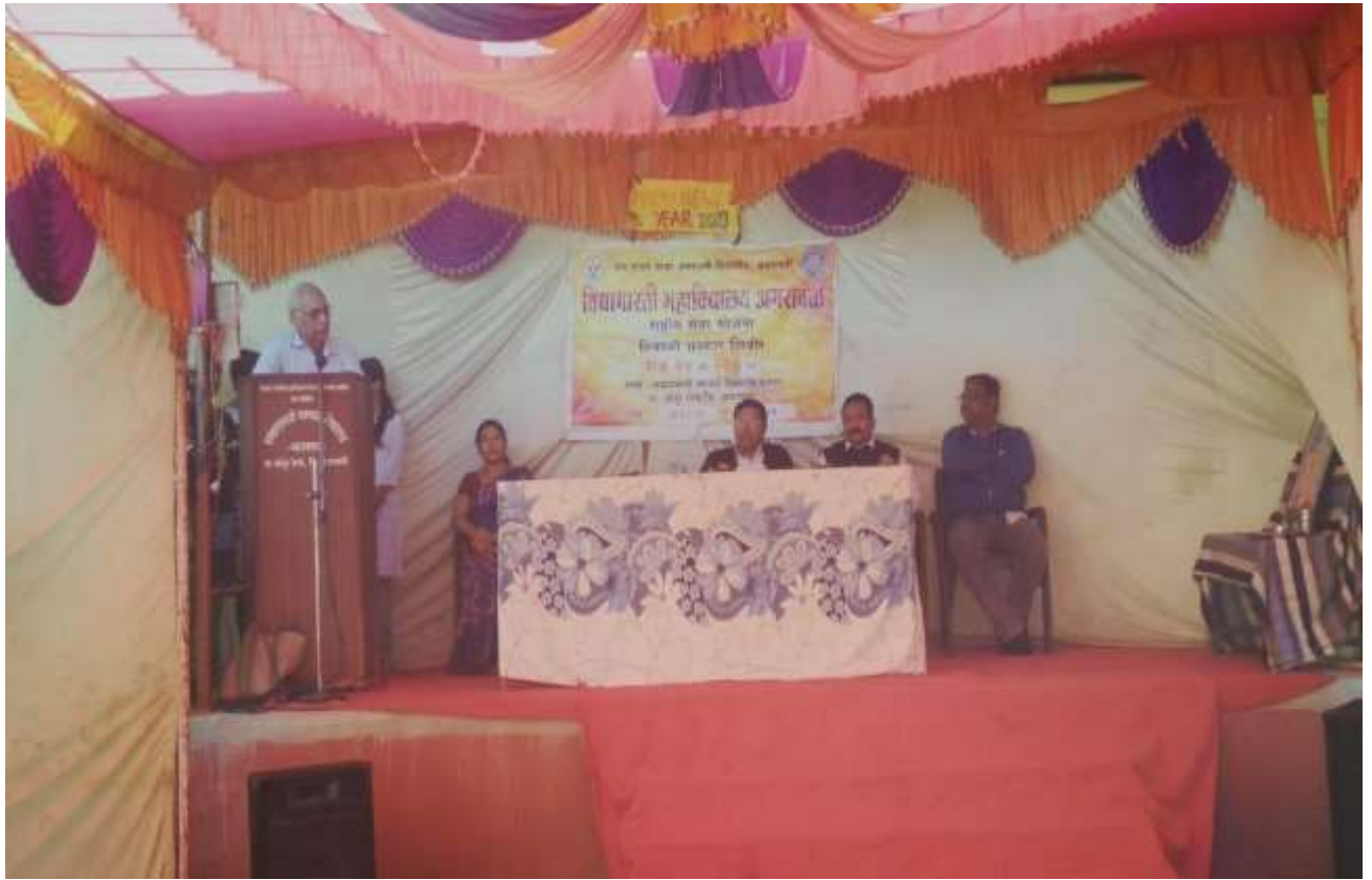
Valedictory Function of Winter Special Camp