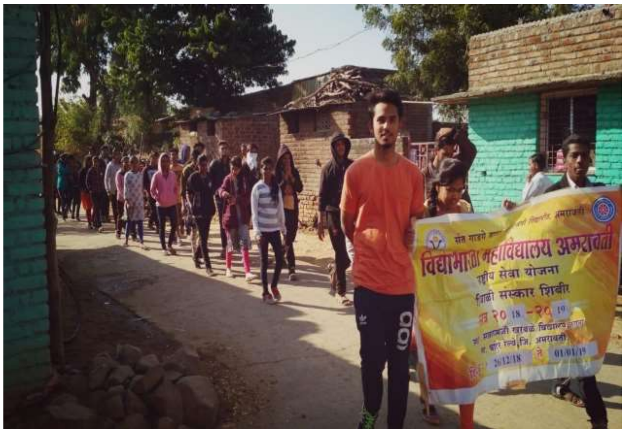
NSS Volunteers participating in Morning Rally