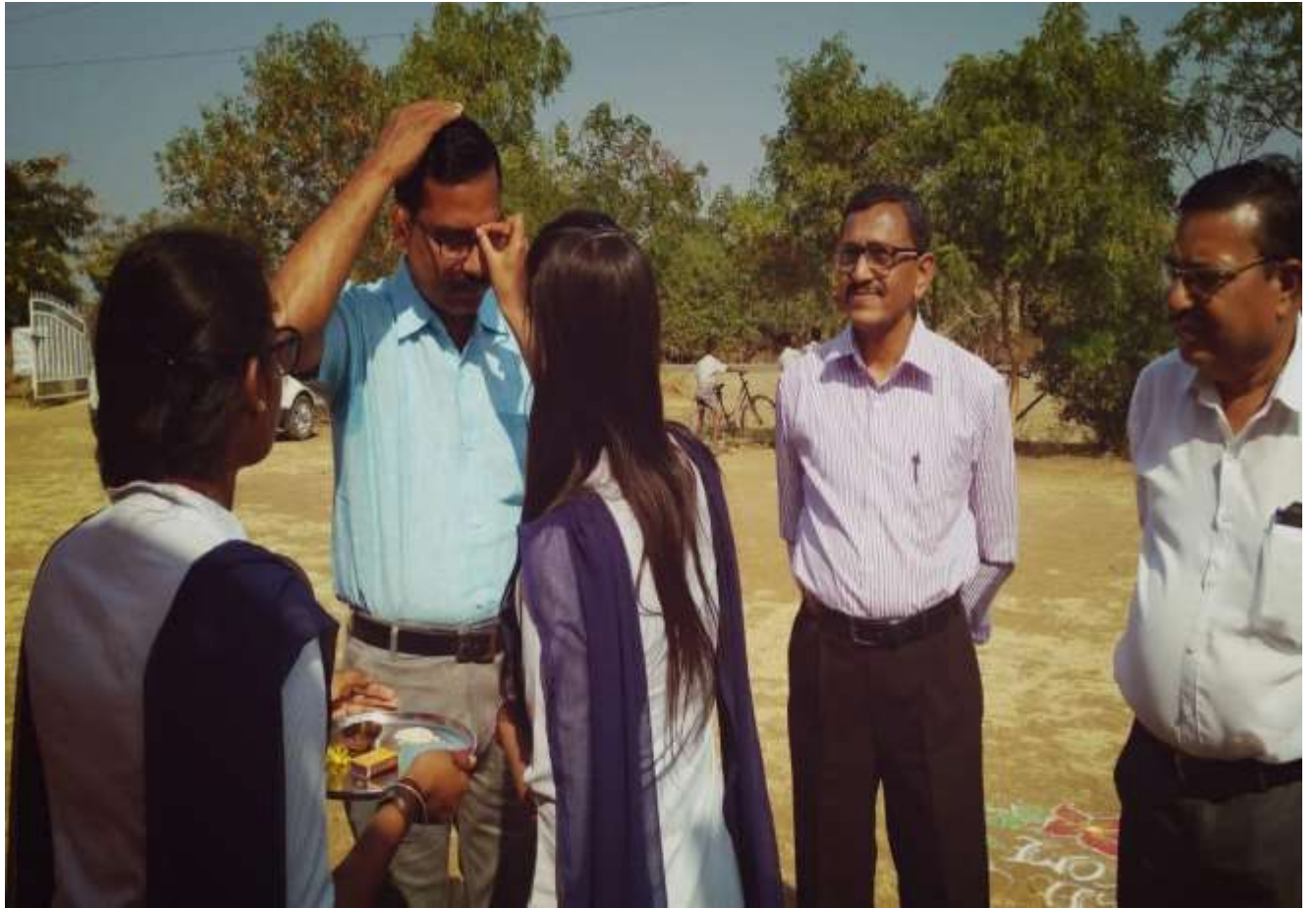
Guests of the Inaugural Function being Welcomed by NSS Volunteers