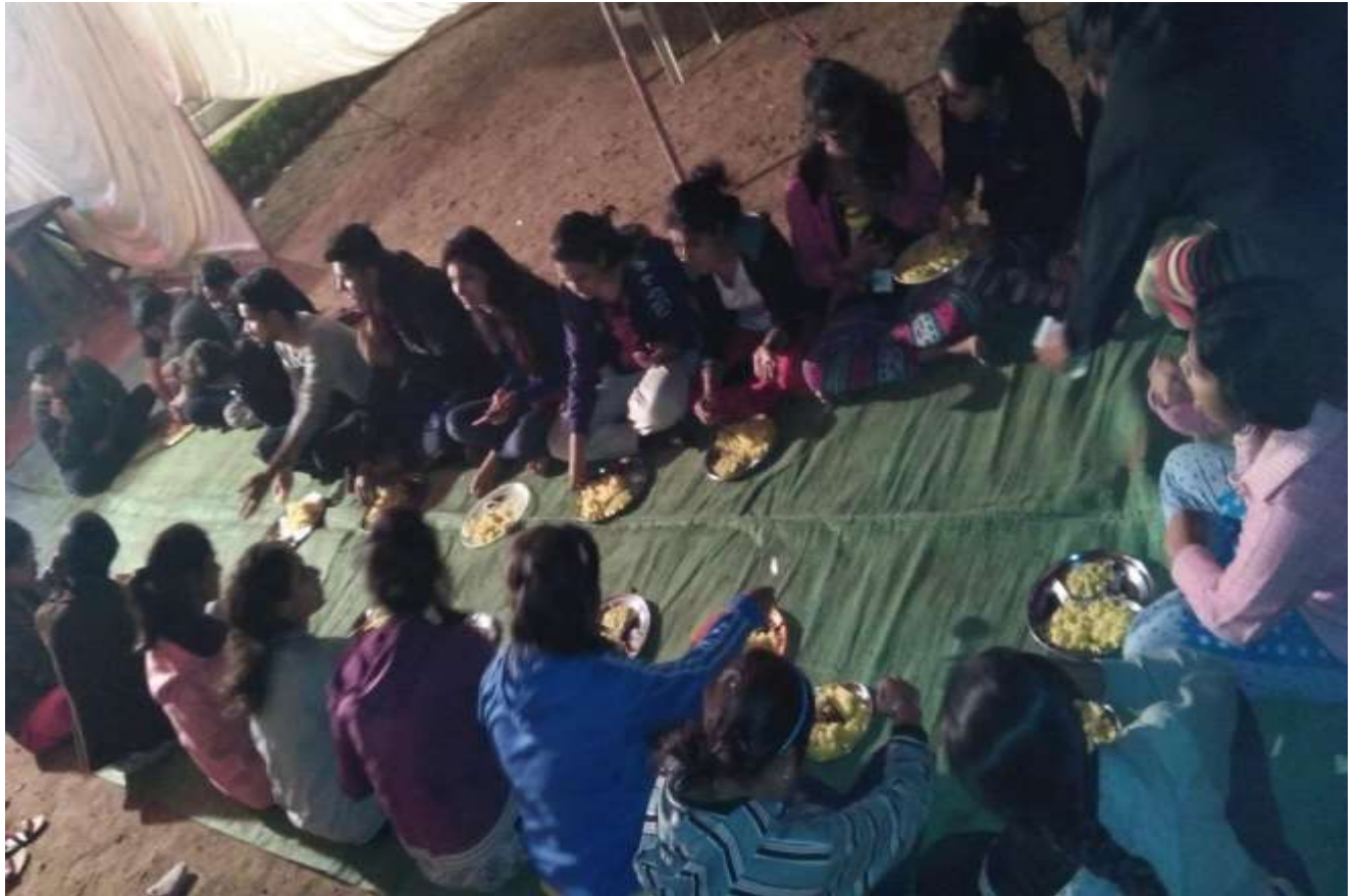
NSS Volunteers taking Dinner at camp