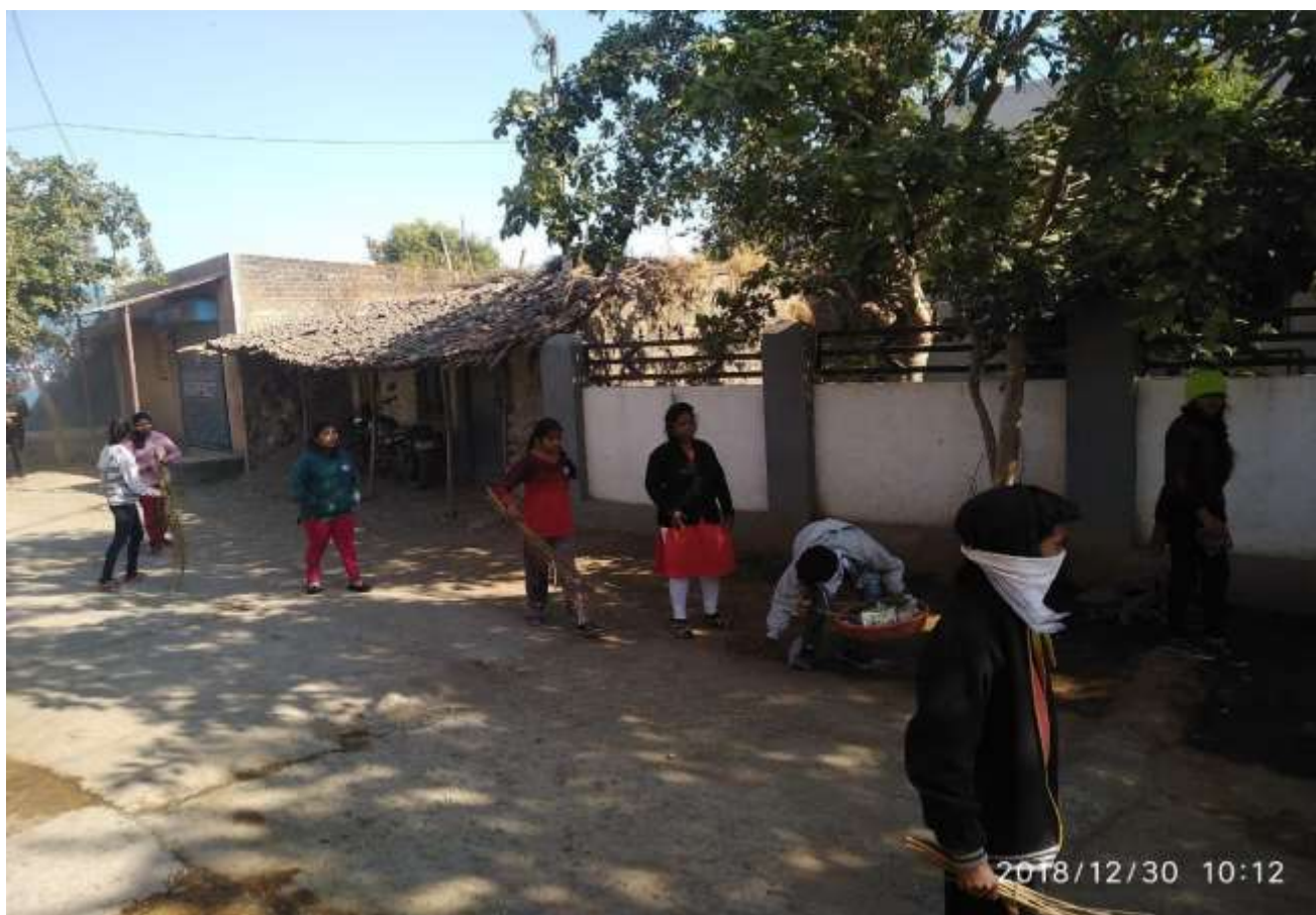
Shramdan at Village