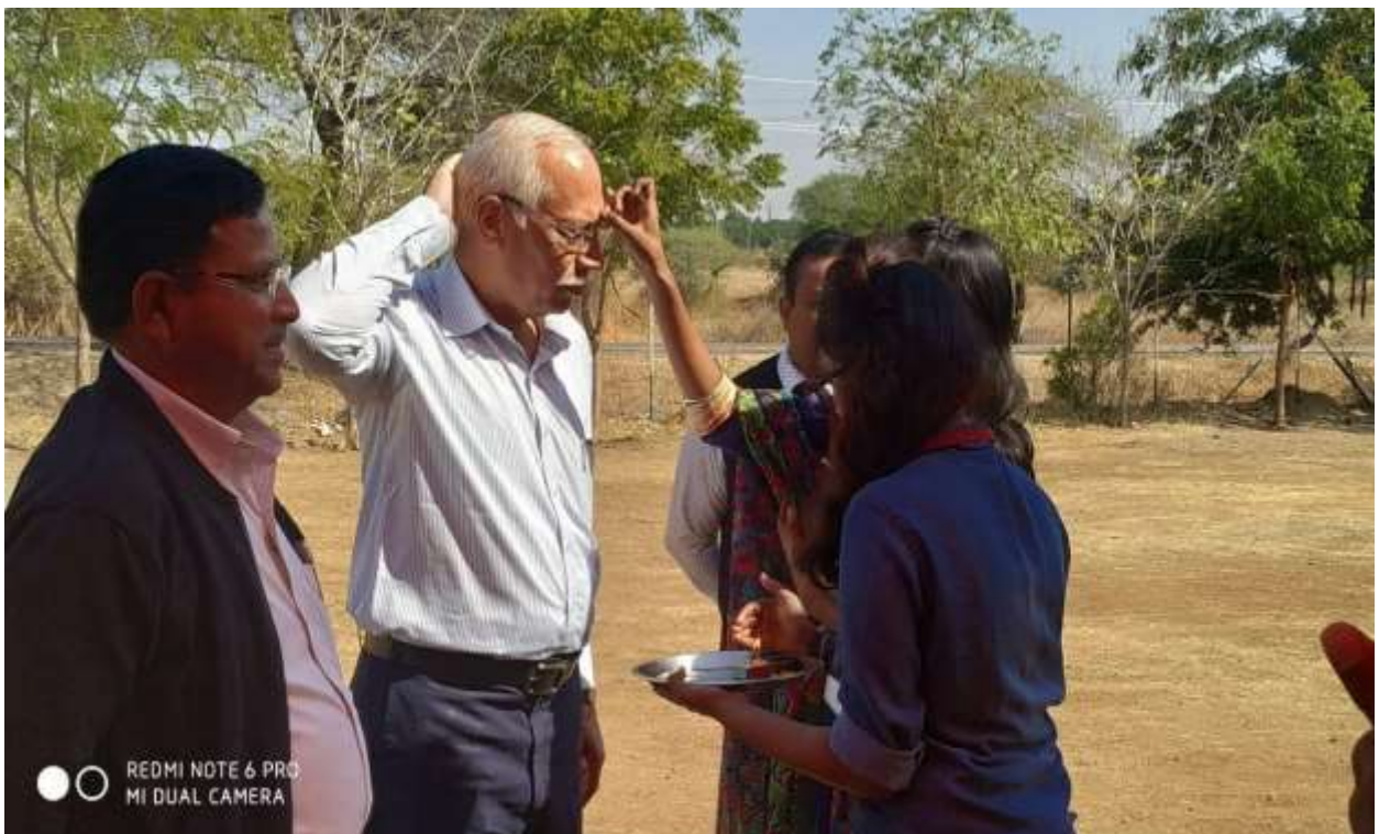
Guests for Valedictory function being welcomed