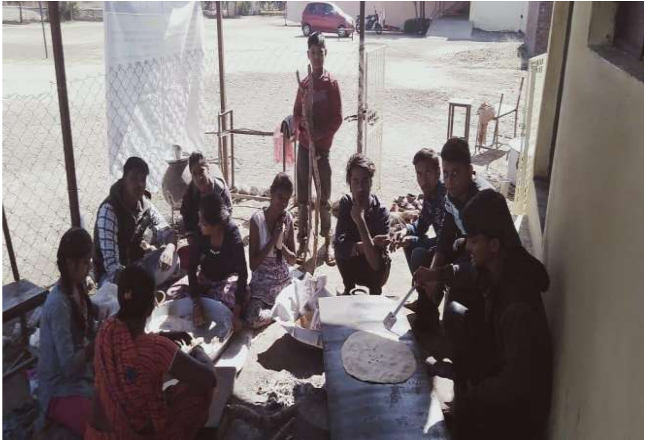
NSS Volunteers preparing Food