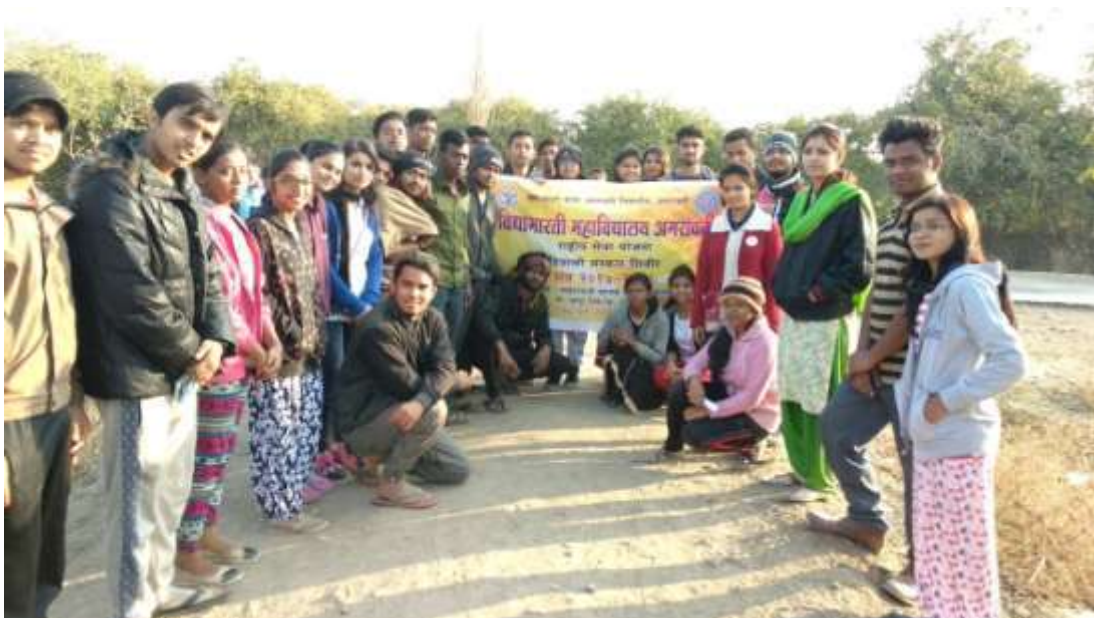
NSS Volunteers participated in Morning Rally