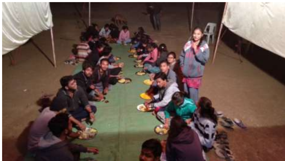
Dinner at camp