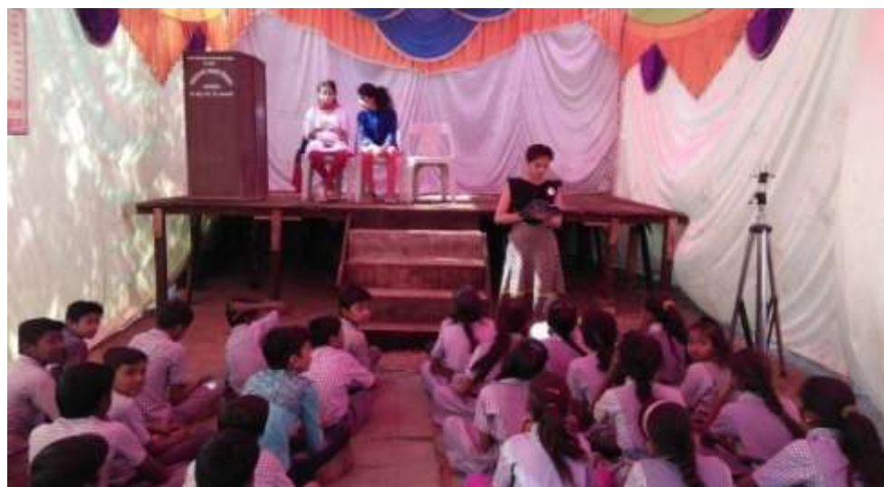
Motivational Program for Students, Karala School