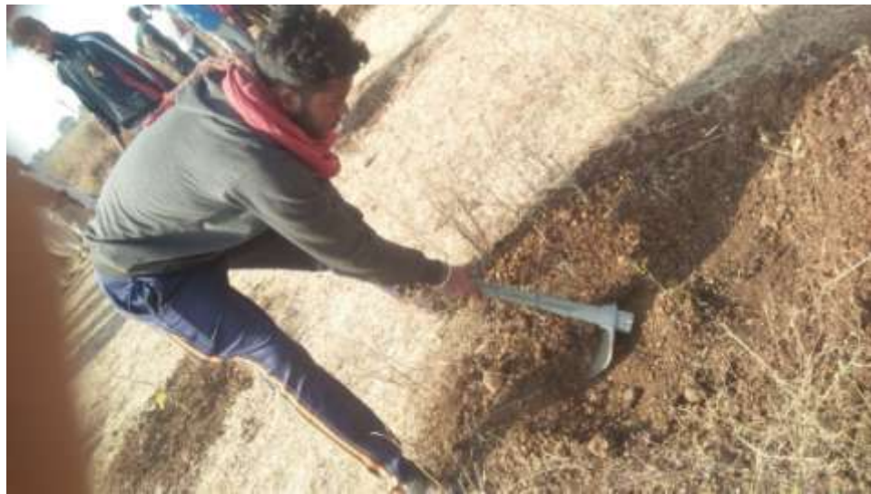
Shramdan at Village