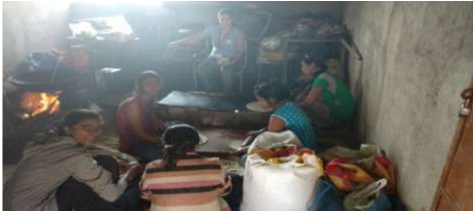
NSS Volunteers preparing Food