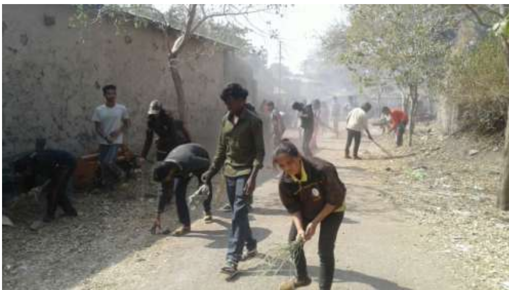
NSS Volunteers participating in Cleanliness Campaign