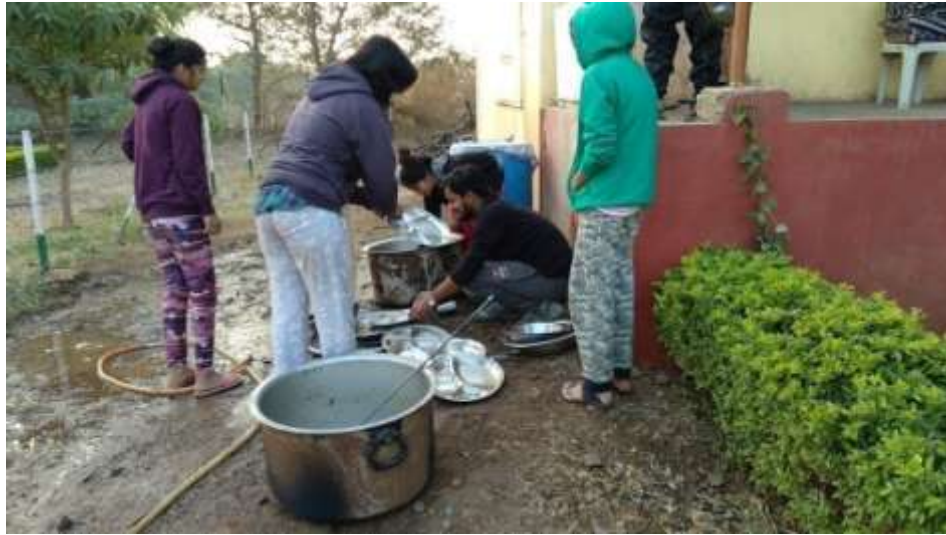
Cleaning after lunch and dinner