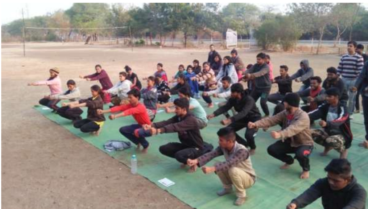
NSS Volunteers Participating in Prayer&Performing Exercise and Yoga