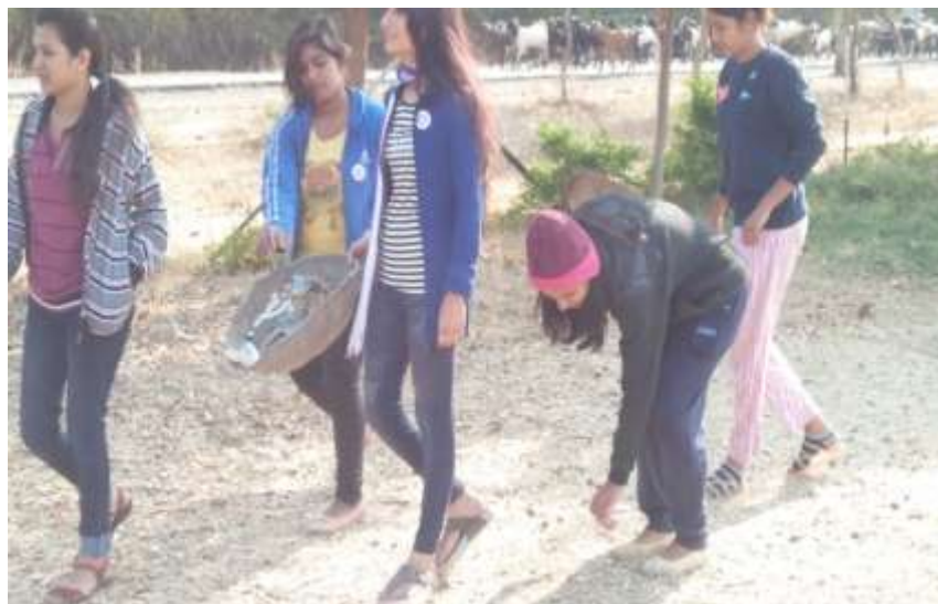
Cleaning of the Camp Area on 08/01/2018 and 09/01/2018