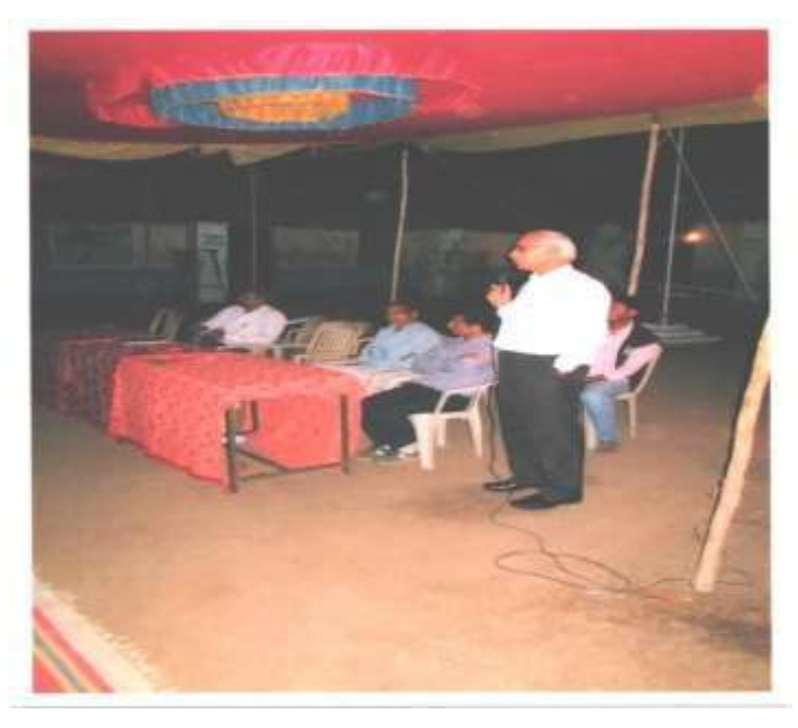
Hon`ble Principal addressing the NSS Volunteers