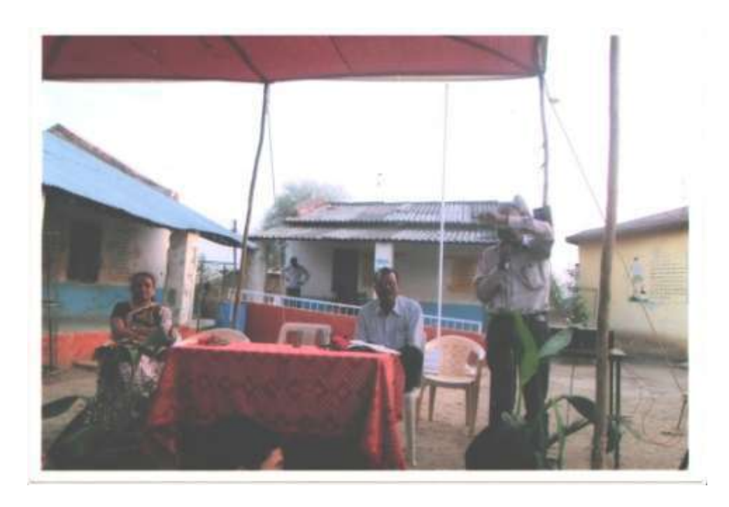
Guest addressing the students