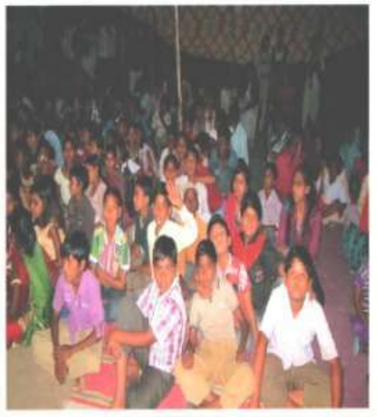
N.S.S. Volunteers performing in Cultural Program