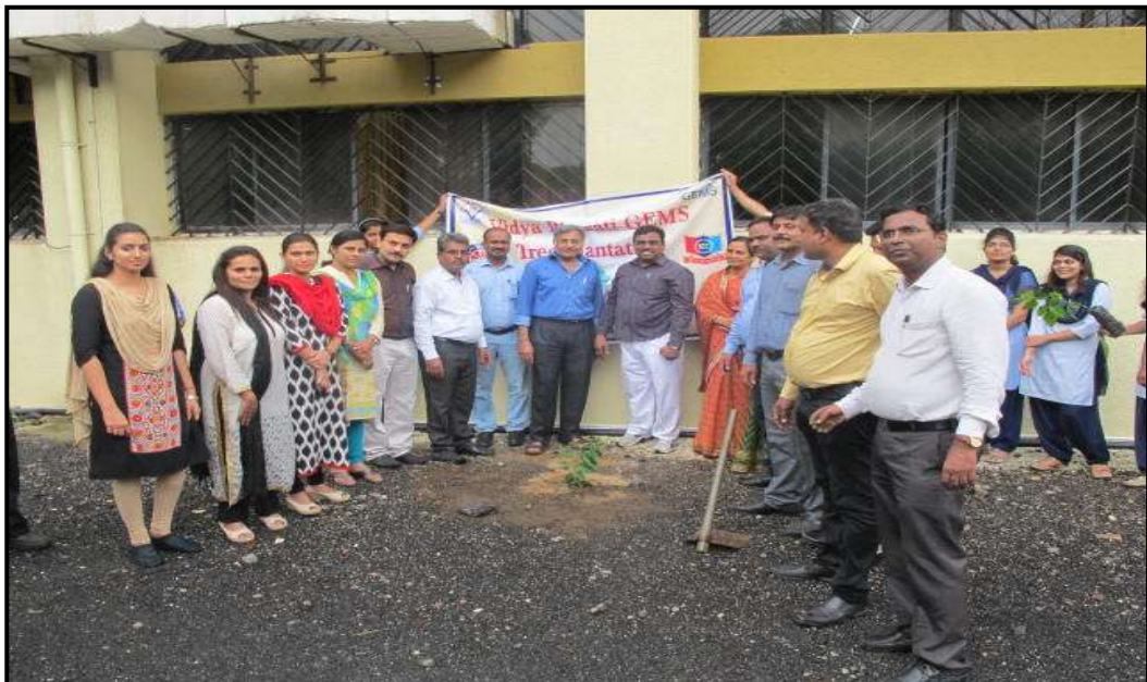
College staff Participated in Tree Plantation Drive