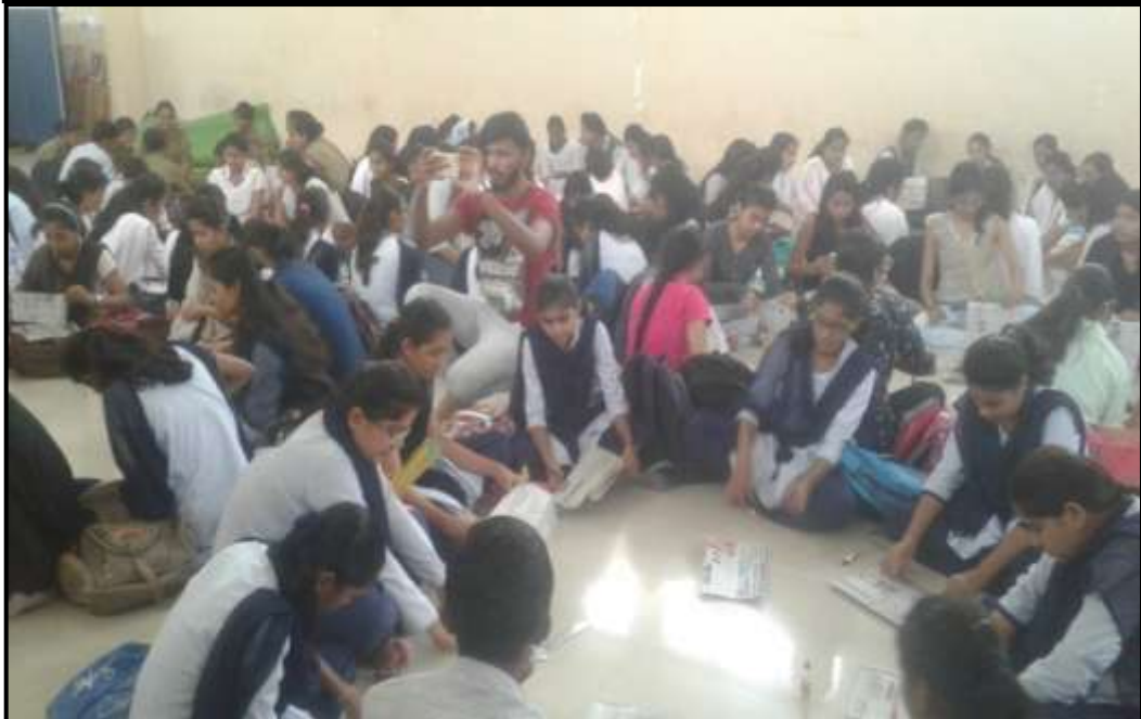
Students participating in Paper Bag Making Workshop