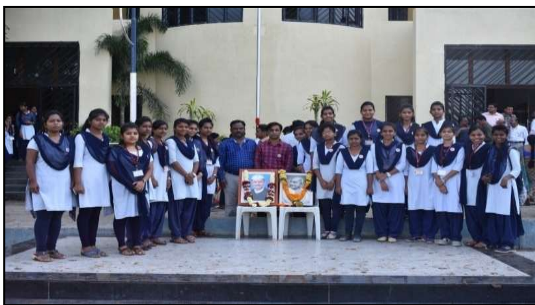
Students & Staff participated in celebration of Birth Anniversary of Legendry