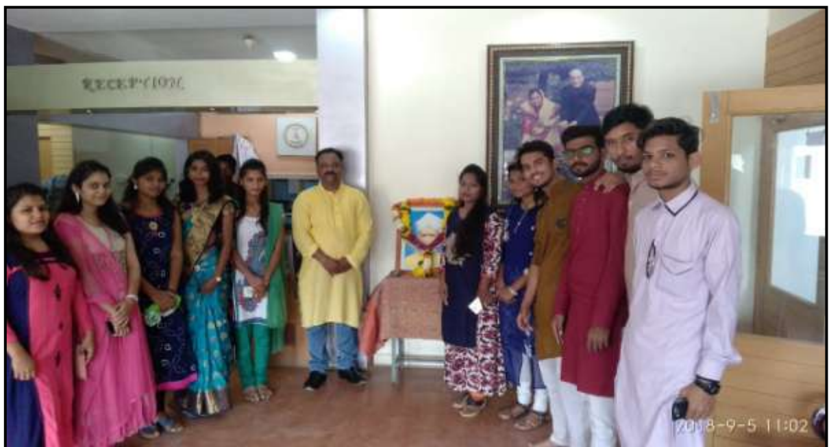
NSS PO and Students celebrated Birth Anniversary of Dr.Radhakrushnan