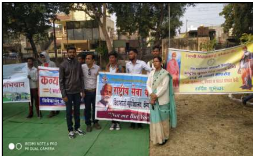
N.S.S. volunteers participated in Youth day programme