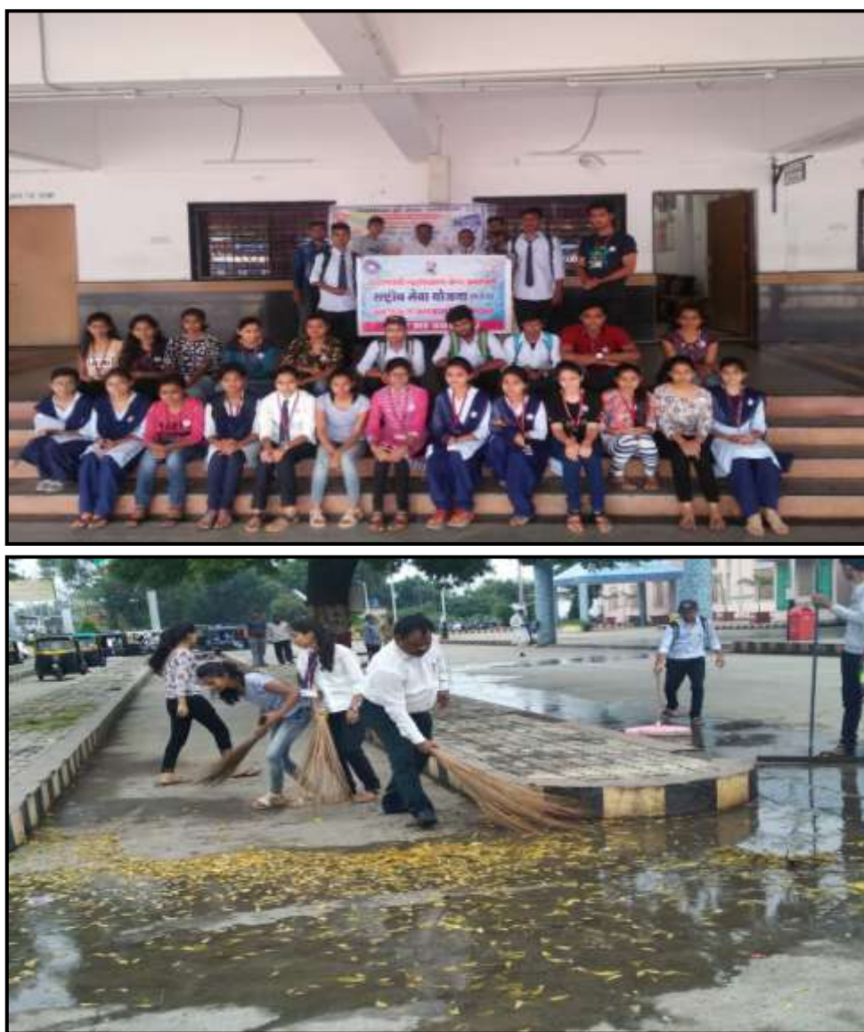
Students & NSS PO participated in Cleanliness drive

The NSS units of the College organized a cleanliness campaign at New Amravati Railway Station on 22.09.2018 as part of the Swachh Bharat Mission of Govt. of India. The programme was inaugurated by Dr.N.R.Thorat Programme officer National Service Scheme, VidyaBharatiMahavidyalaya, Amravati. The mass cleaning programme was led by Station Superintendent. Around 80 NSS volunteers participated in the work relating to the cleaning of the platforms and pathways of the railway station.