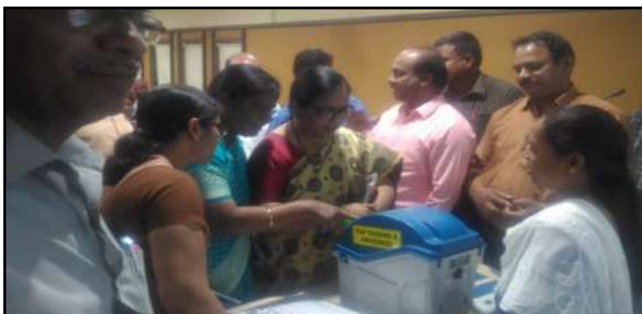
Officers showing the demo of the machine to the students and staff