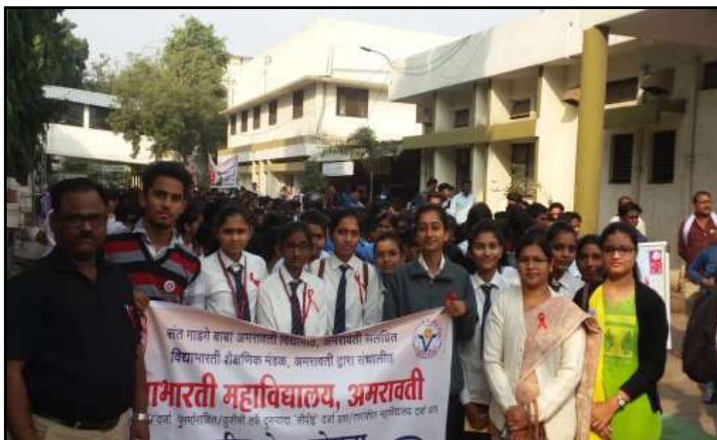
N.S.S. Volunteers and PO participating in AIDS Awareness Rally