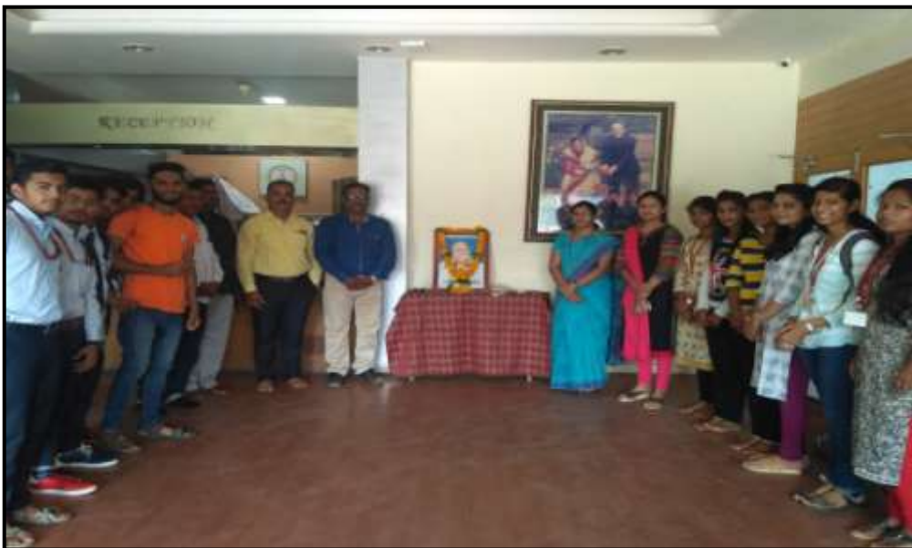
Hon`ble Principal, Staff & Students Participated in Birth Anniversary