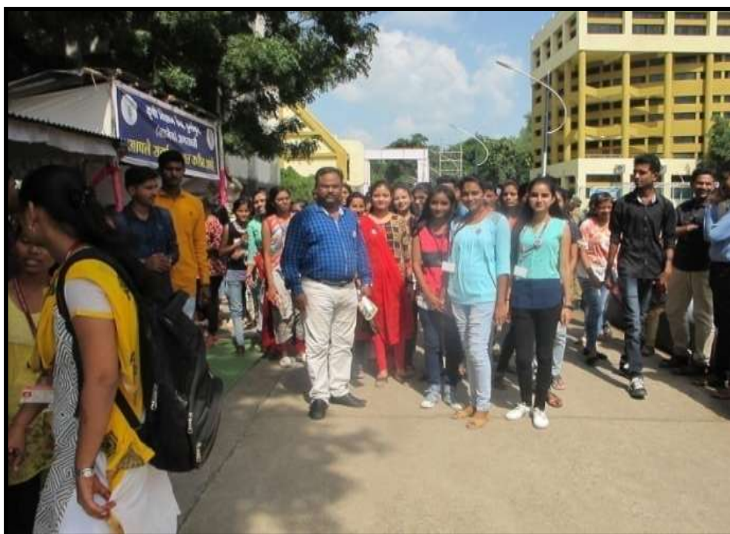
N.S.S. Volunteers participated in Trade Fair

During this event all the N.S.S. Volunteers actively participated and they created awareness about the cleanliness among the students; they disposed the plastic bottles, picked up the disposal tea, cup and plates used by the students and disposed in a dustbin provided by the GEMS.