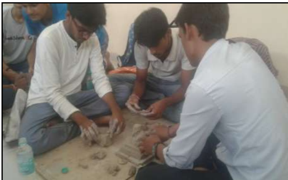
Students participating in Ganesh Idol making Workshop