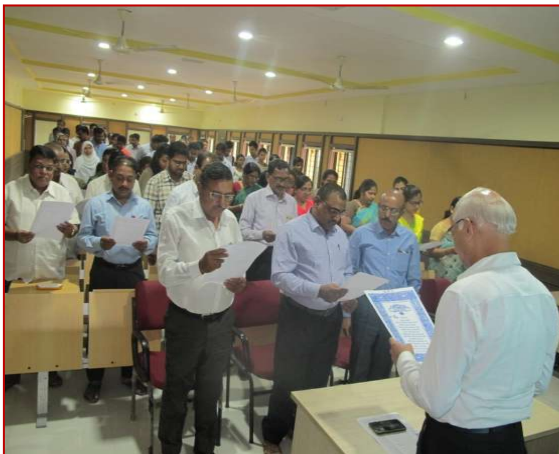
Teaching and non-teaching staff reading preamble