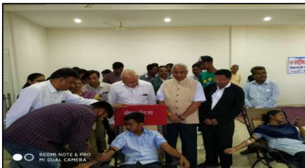
N.S.S. Volunteers participated in Blood Donation Camp