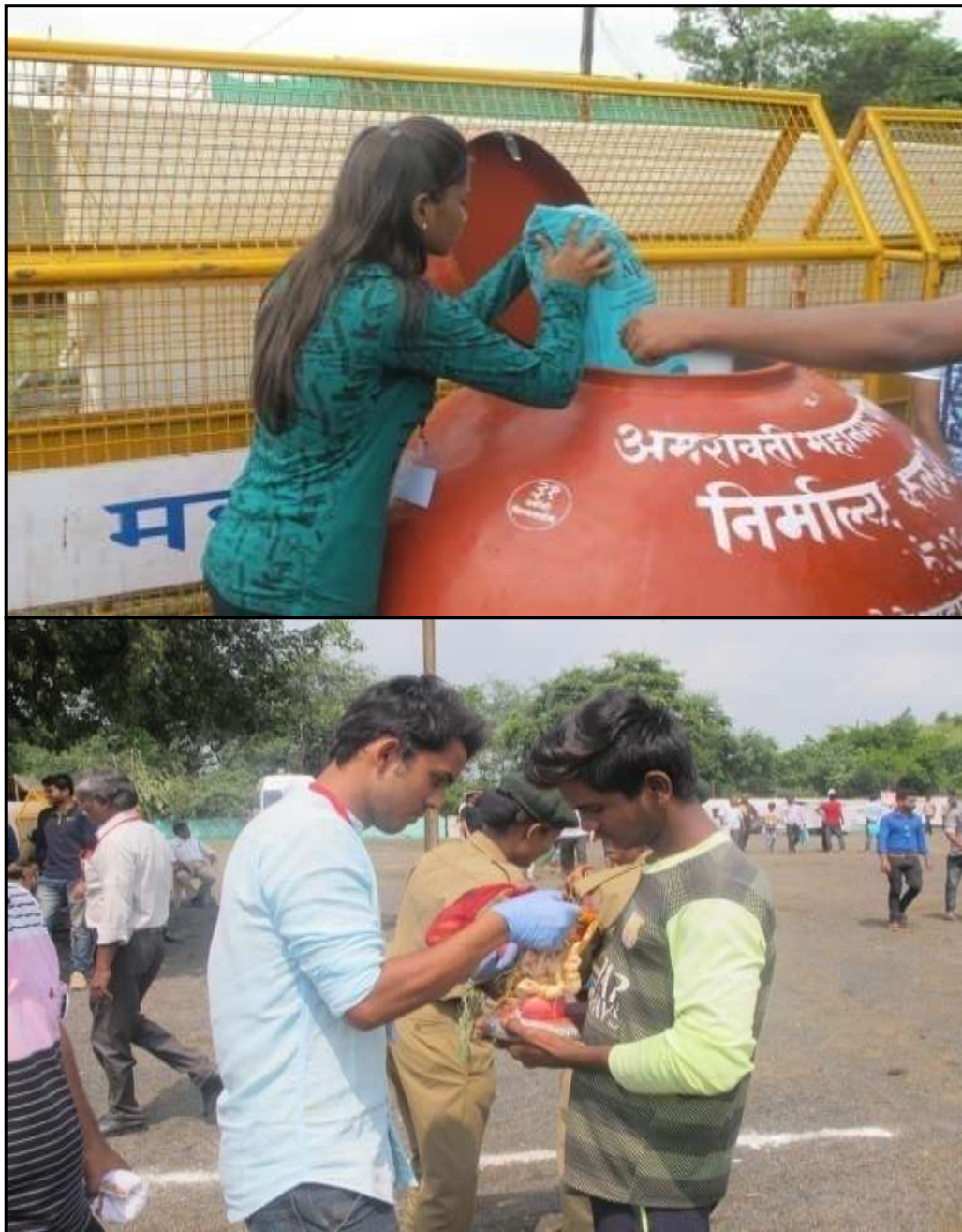
Students participating in Nirmalya Visarjan

The students of NSS unit of Vidya Bharati Mahavidyalaya, Amravati decided to contribute to lessen the pollution on the occasion of Ganesh visarjan by dumping nirmalya appropriately at Wadali Lake, Amravati. All the students and faculty members made the peoples aware of hazards of waste in water. So they asked people not to put their nirmalya as and other waste in the water and tried to spread awareness about circumstances of pollution.