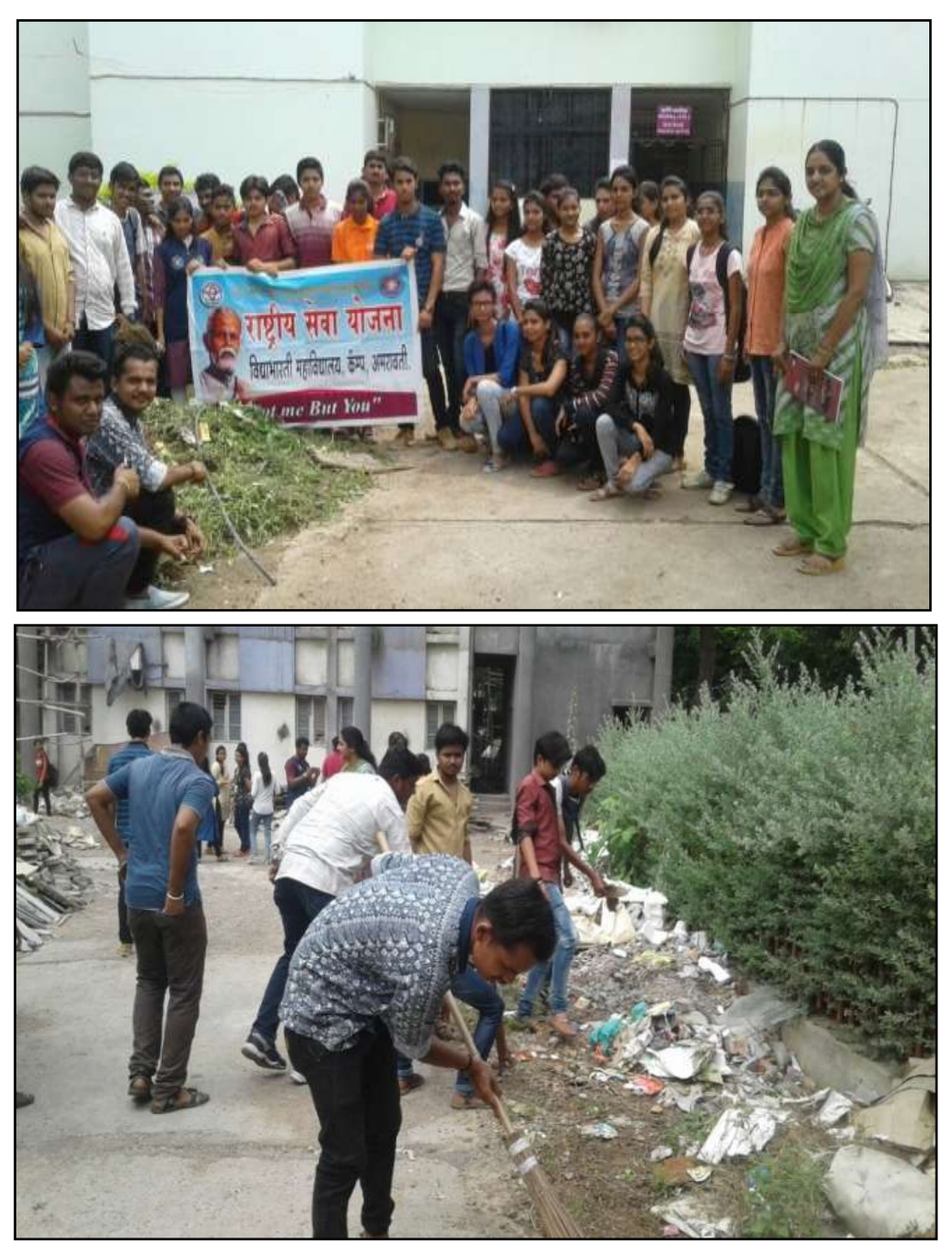
NSS Volunteers participating in Cleanliness Drive

The NSS Group of Vidya Bharati Mahavidyalaya, Amravati organized a campaign under the program "Swachhta Pakhwada" to clean the college premises from 1<sup>st</sup> Aug to 15<sup>th</sup> August. The whole college was divided into some parts and each part was cleaned by the volunteers according to the schedule.