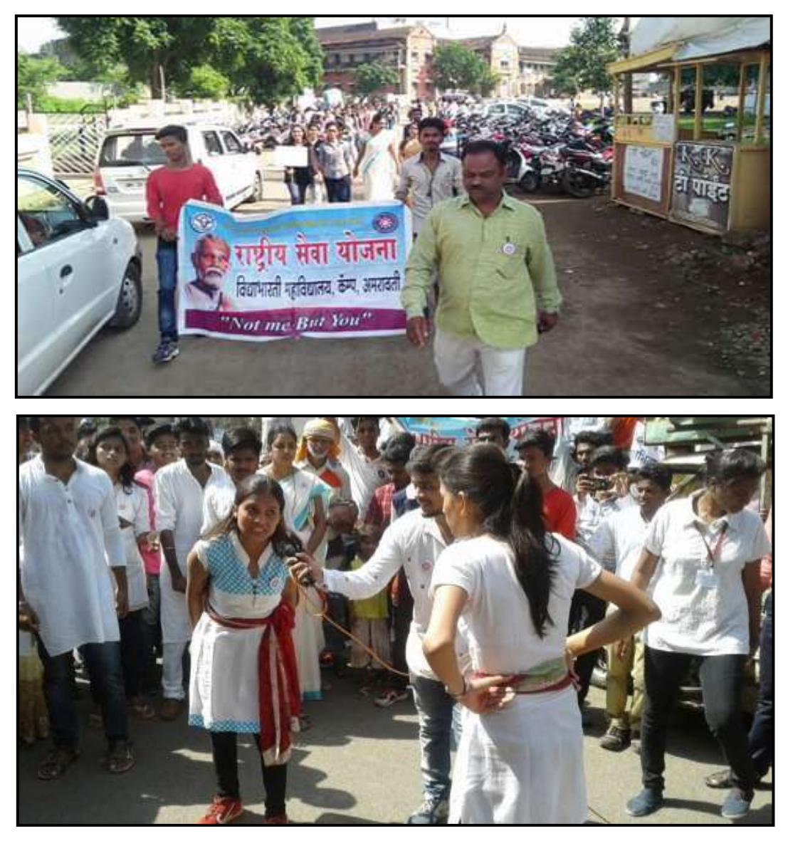
N.S.S. volunteers performing a Street Play

S.G.B.A.U.Amravati organised a Rally on Swacchata awareness from Neharumaidan to Jaistambhchouk, Amravati on dated 24/09/2019. The unit of Vidya BharatiMahavidyalaya was actively participated. During this event all the N.S.S. Volunteers of Vidya Bharati Mahavidyalaya, presented a street play on Swacchata awareness and they created awareness about the cleanliness among the peoples they also remove the plastic bottles, and pick up the disposal tea cup during the rally.