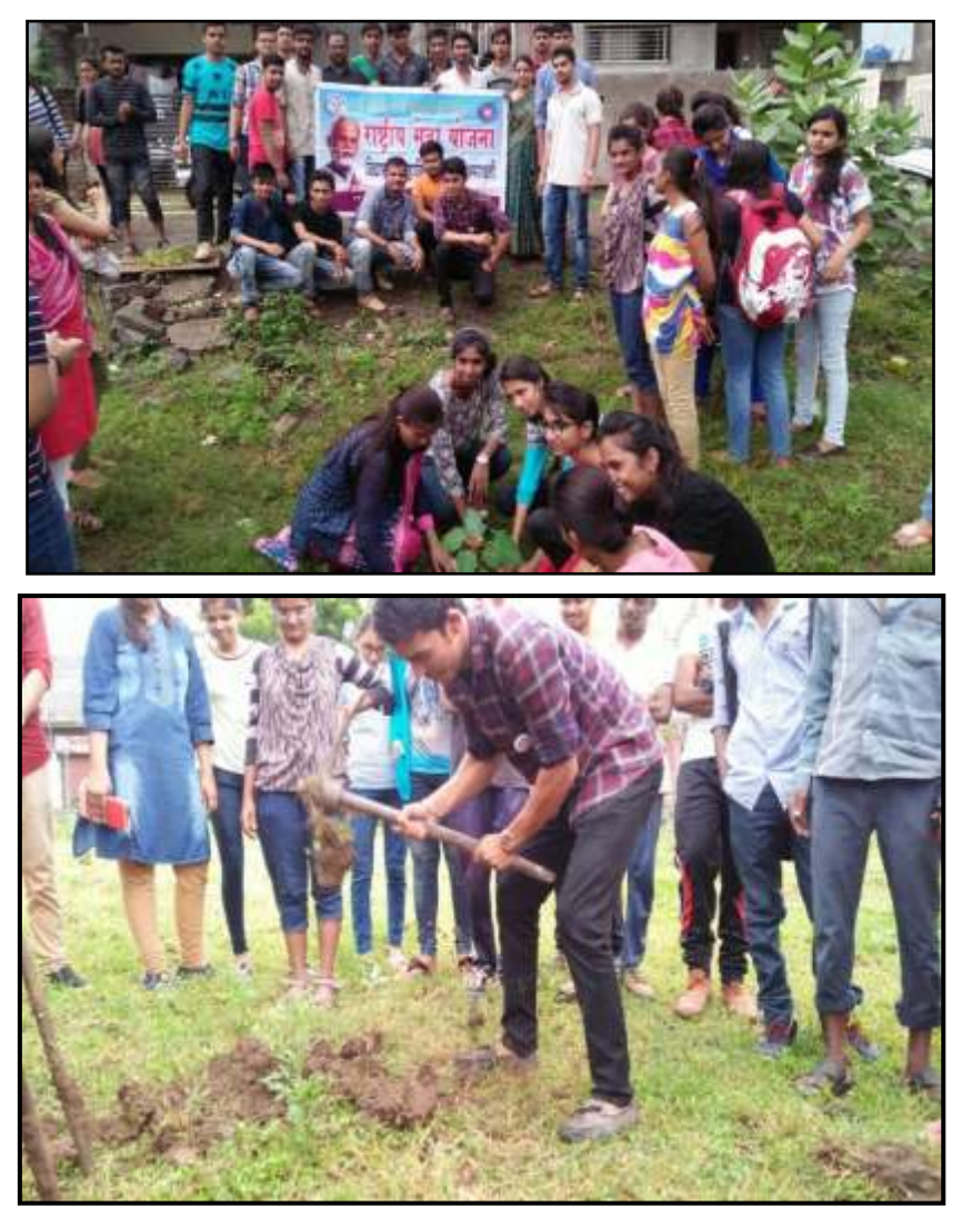
N.S.S. volunteers participated in Tree Plantation drive

Department of N.S.S.Vidya Bharati Mahavidyalaya, Amravati organised Tree Plantation Programme as directed by the Govt. of Maharastra under the scheme Vanmohtsava as it was decided to plant 33 croresplants. The students and teachers selected the open places at Kewal Colony Shegaon Naka, Amravati to plant saplings in a well-organised way. The saplings were supplied by the Govt. Nursery Bamboo garden, Amravati. The students planted saplings of various types like Kadunimb, Kadubadam, ect. and fenced them and watered the plants. Every step of the programme was appreciated by the representatives of the administration college and the local forest department officials.