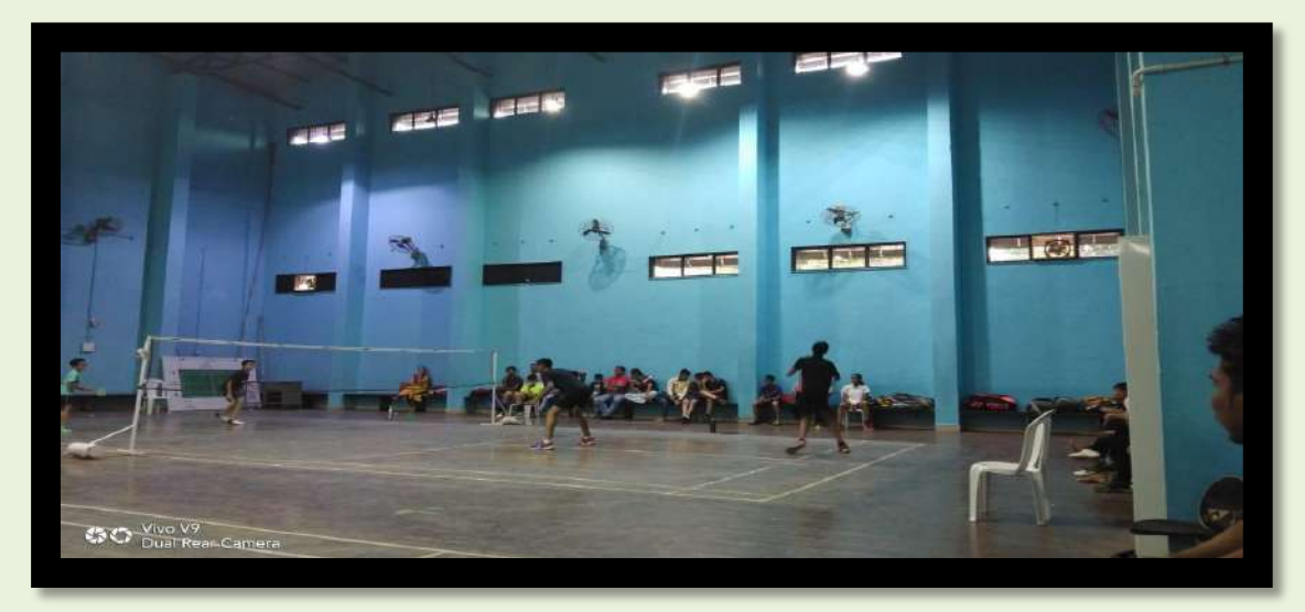
Intercollegiate Badminton Tournament

A Click with A Judges during Intra faculty Badminton Tournament