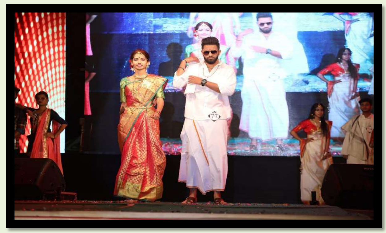
Students Participating in Fashion Show Competition