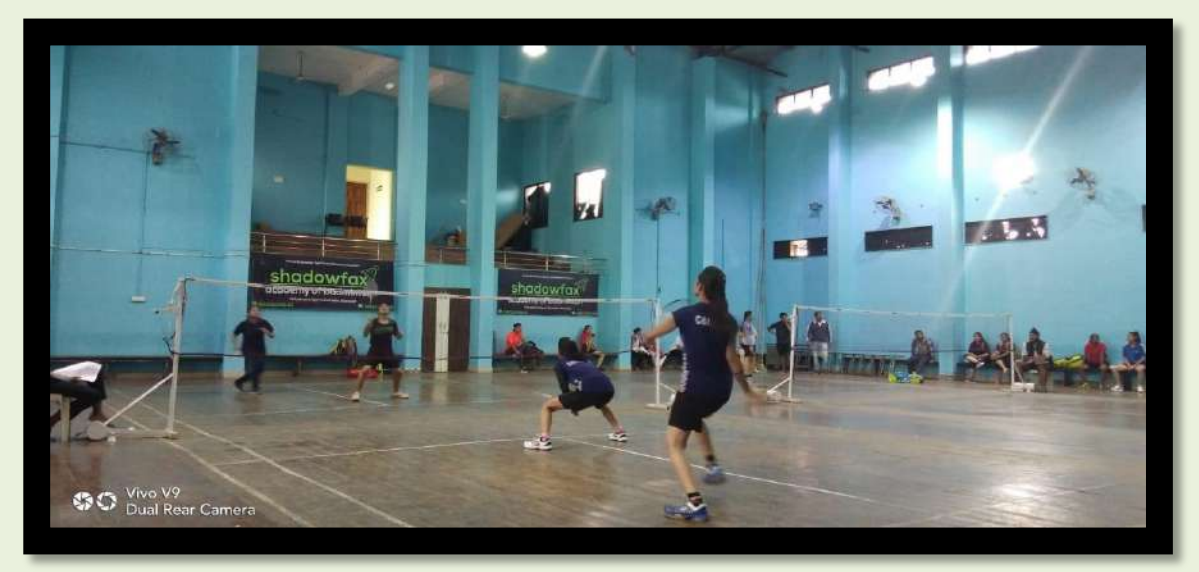
Inter Collegiate Badminton Tournament Team

Total 06 students participated in the Intercollegiate tournament which was held from 18/09/2019 to 22/09/2018 at G.S. Tompe Mahavidyalaya, Chandur Bazar.