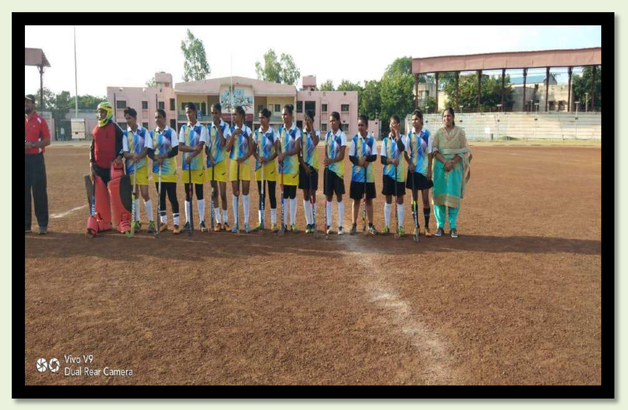
Introduction and Blessings from the Guest of the Tournament