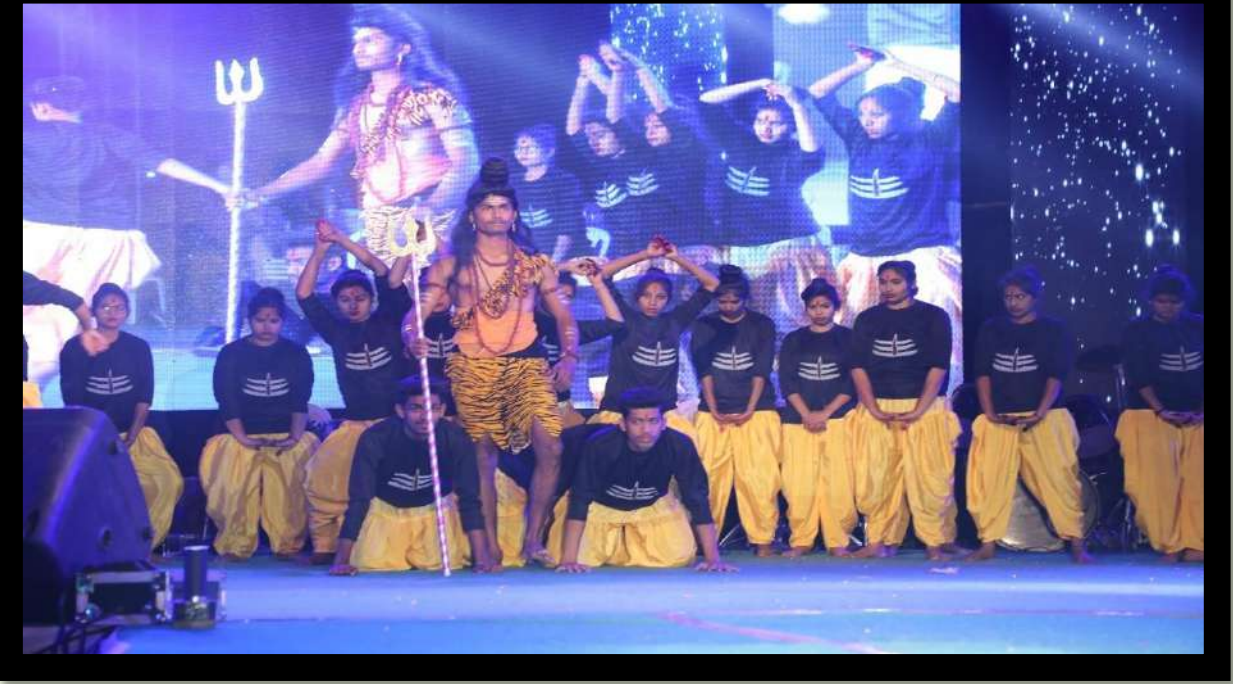
Students performing Group Dance