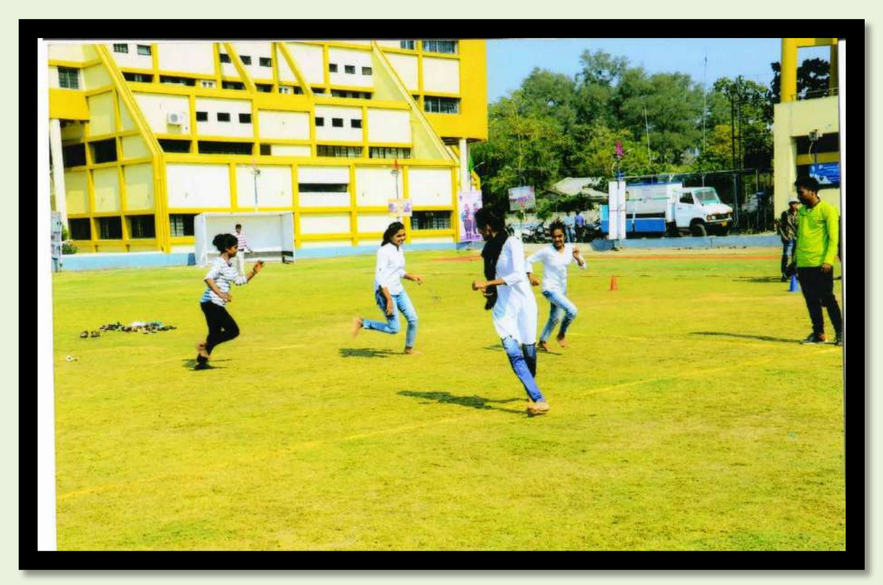
Students participating in Langdi Competition