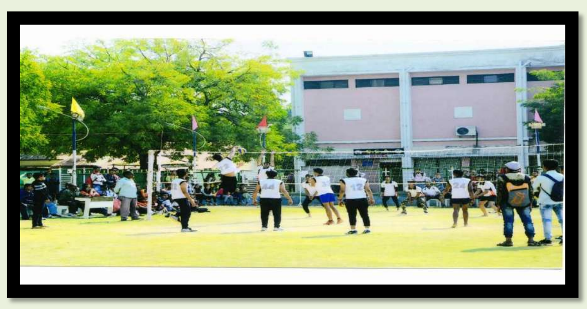
Sports SSport Carnival- Volleyball Men Tournament

Also 12 students participated in the Inter Collegiate tournament which was held from 08/10/2018 to 14/10/2018 at Late Madangopal Mundhada, Arts & Commerce College, Chandur Railway.