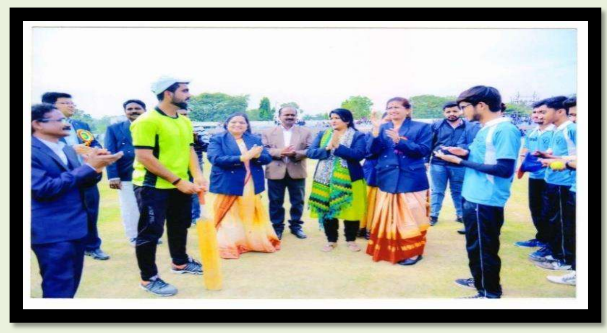
Opening Ceremony of Cricket Tournament

Also, 17 students were participated in the Inter collegiate tournament which was held from 26/11/2018 to 16/12/2018 at Degree College of Physical Education.