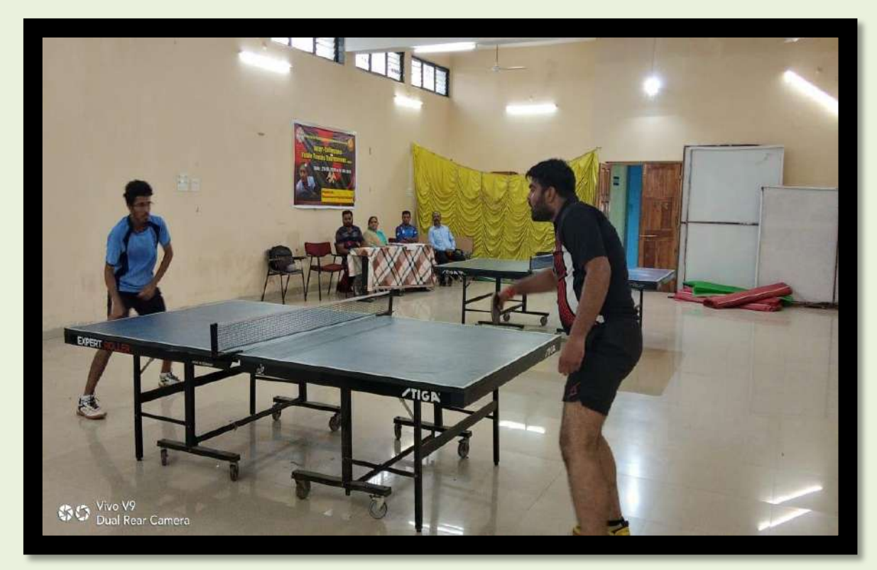
Inter Collegiate Table Tennis Tournament

Also 05 students participated in the Inter Collegiate tournament which was held on 18/09/2019 to 21/09/2018 at Shankarlal Khandelwal Mahavidyalaya, Akola.