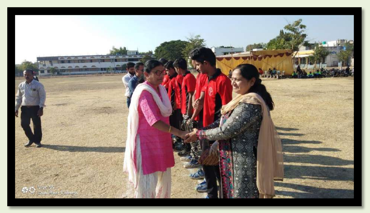
Introduction of Players to the Guest