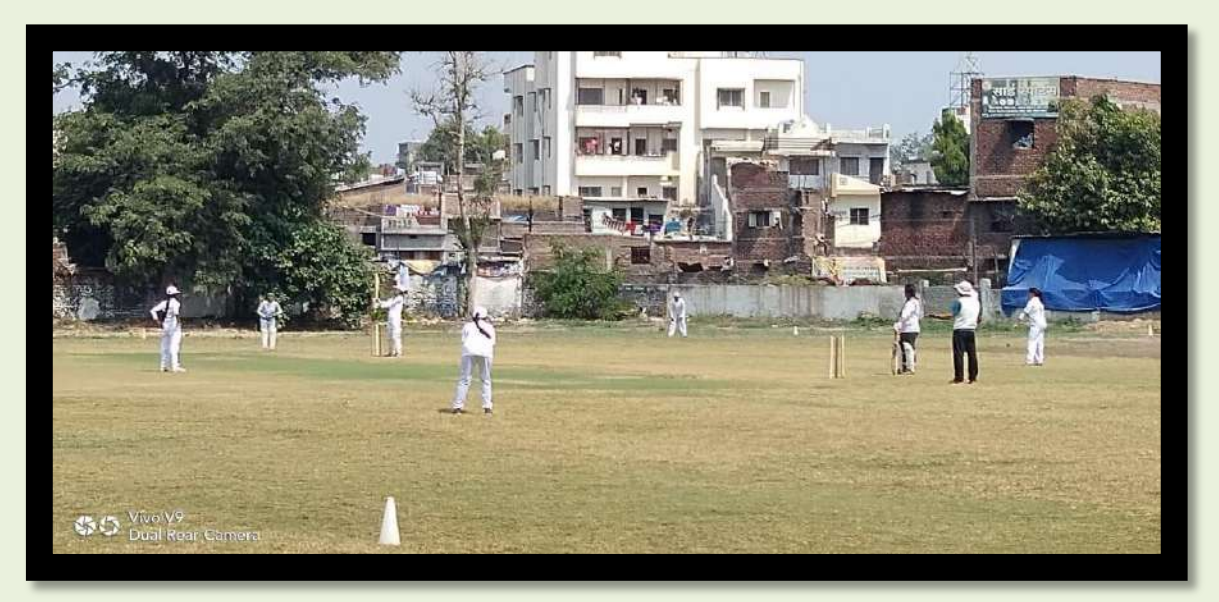
Final Match Between V.B.M.V. Vs H.V.P.M