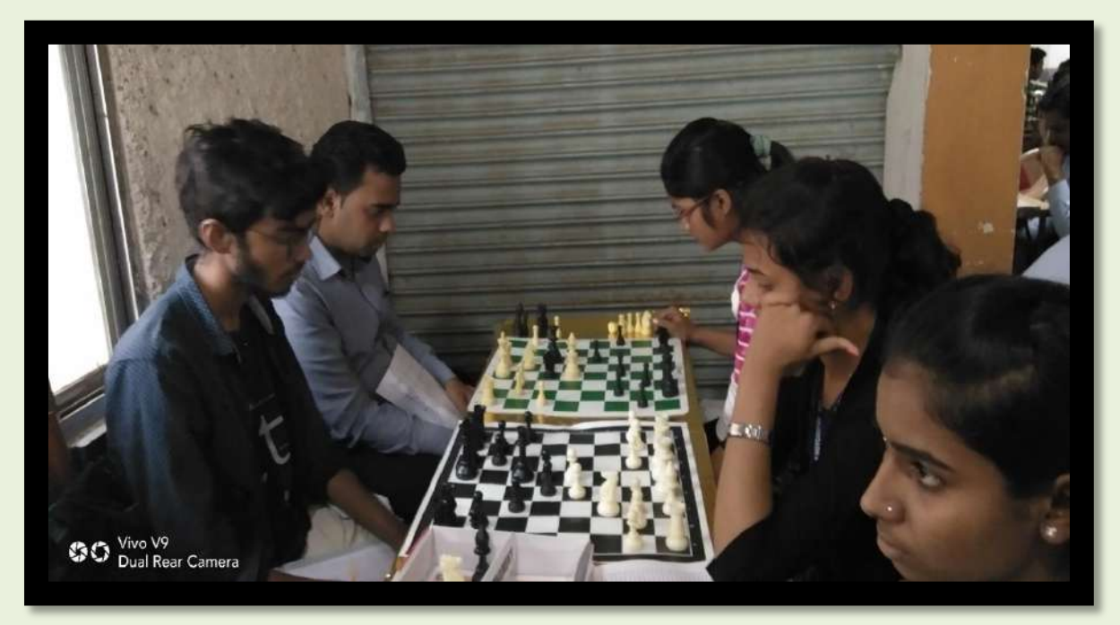
Inter Collegiate Chess Team