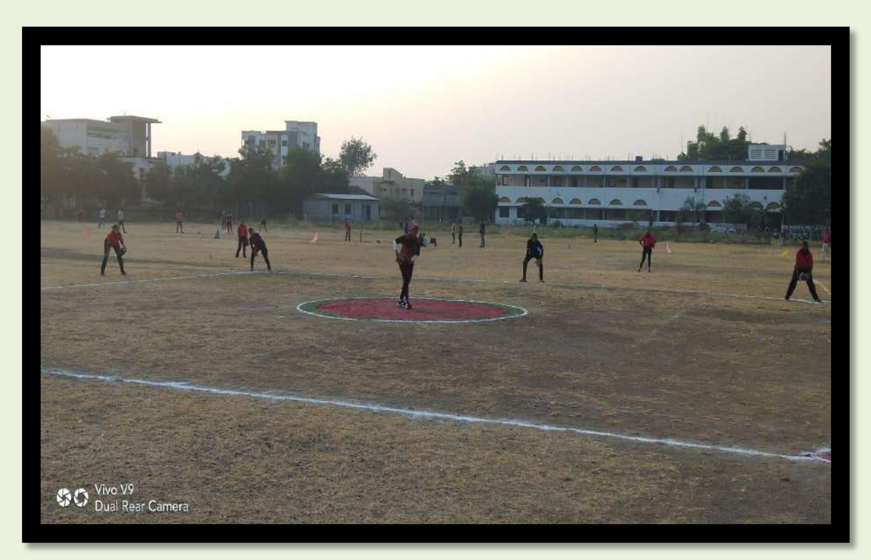
Inter collegiate Baseball Tournament between V.B.M.V and Arts, Commerce and Science College

Total 11 students participated in the Inter Collegiate Tournament which was held from 20/12/2018 to 23/12/2018 at Mahatma Jyotiba Fule Commerce and Vithalrao Raut Arts College, Bhatkuli.