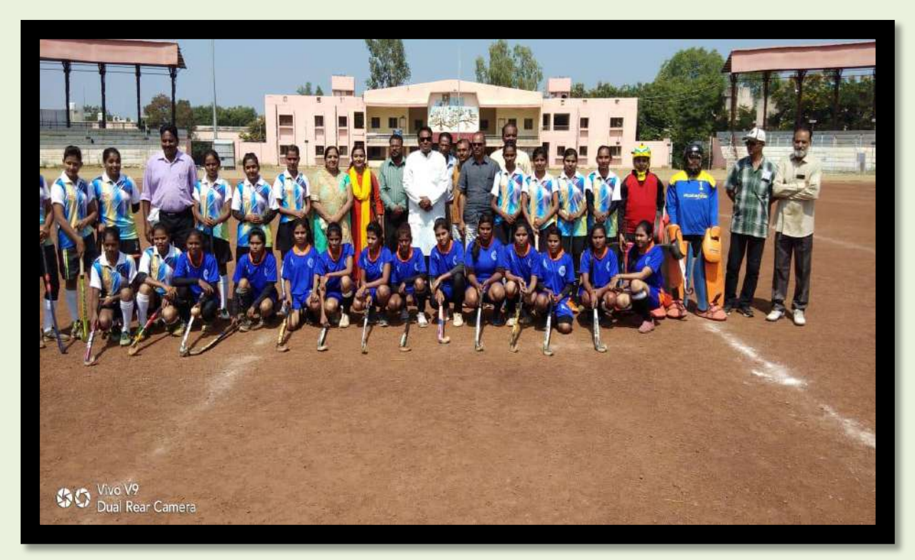
Inter Collegiate Hockey Tournament Team

Total 19 students represented the College team in the Inter Collegiate Tournament which was held from 19/10/2018 to 21/10/2018 at Rajashree Shahu Science College, Chandur Railway.