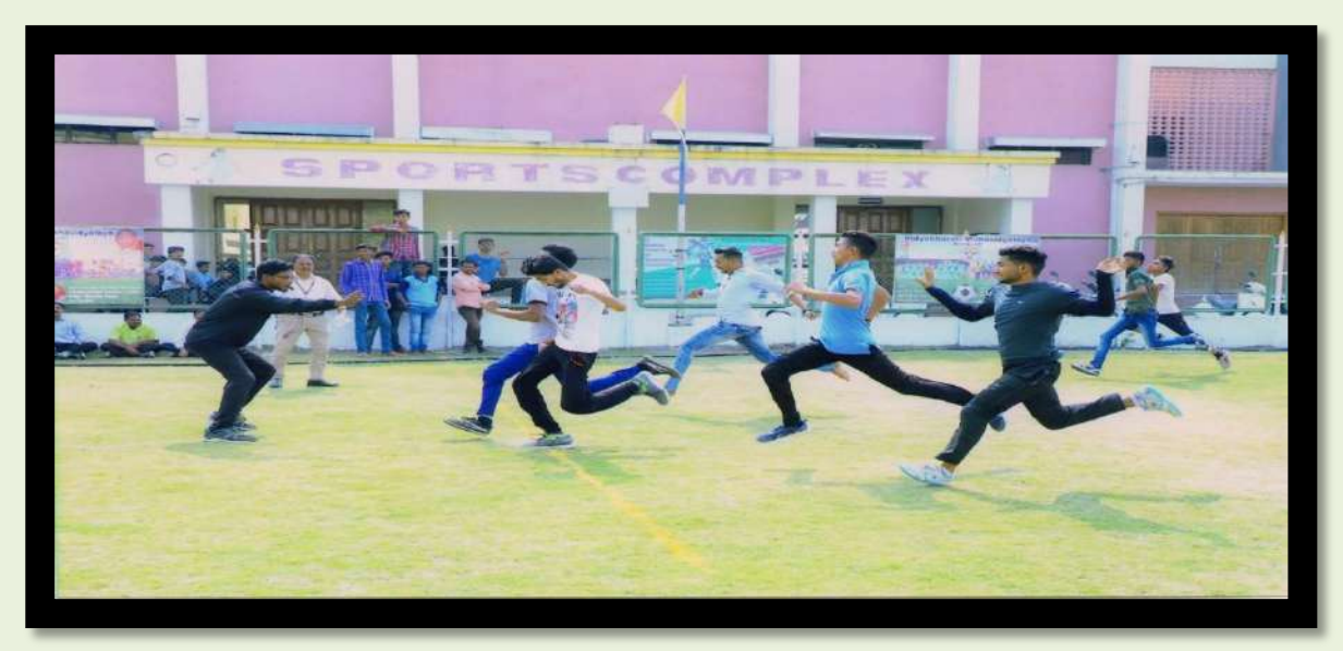
Athletics Competition- Sports Carnival

Also 12 students represent our college at Inter Collegiate level tournament which was held from 02/10/2018 to 04/0/2018 at Degree College of physical education, Amravati.