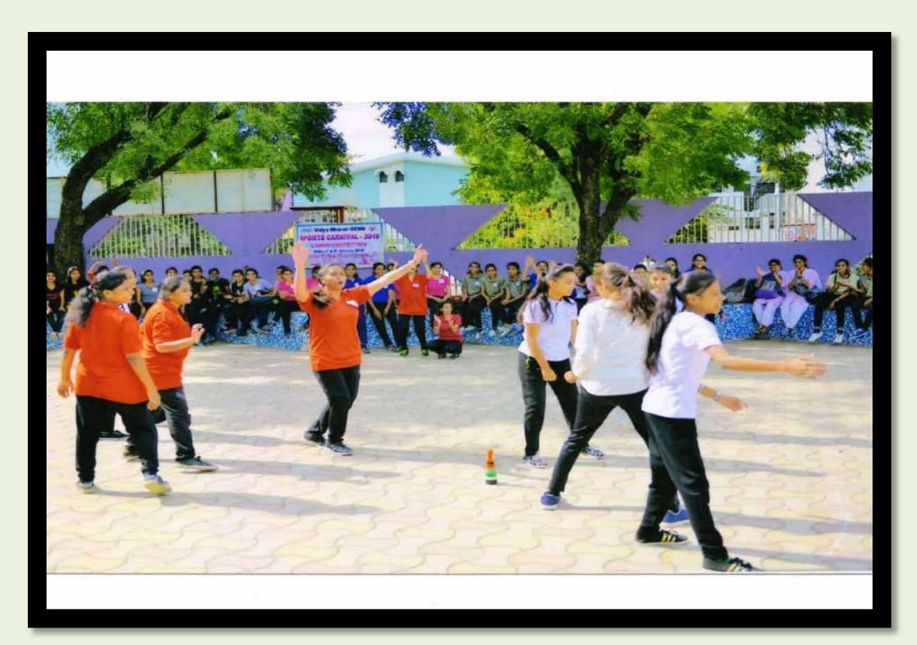
Students participating in Lagori Competition