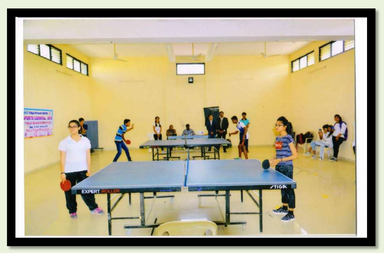
Table Tennis Tournament in Sports Carnival