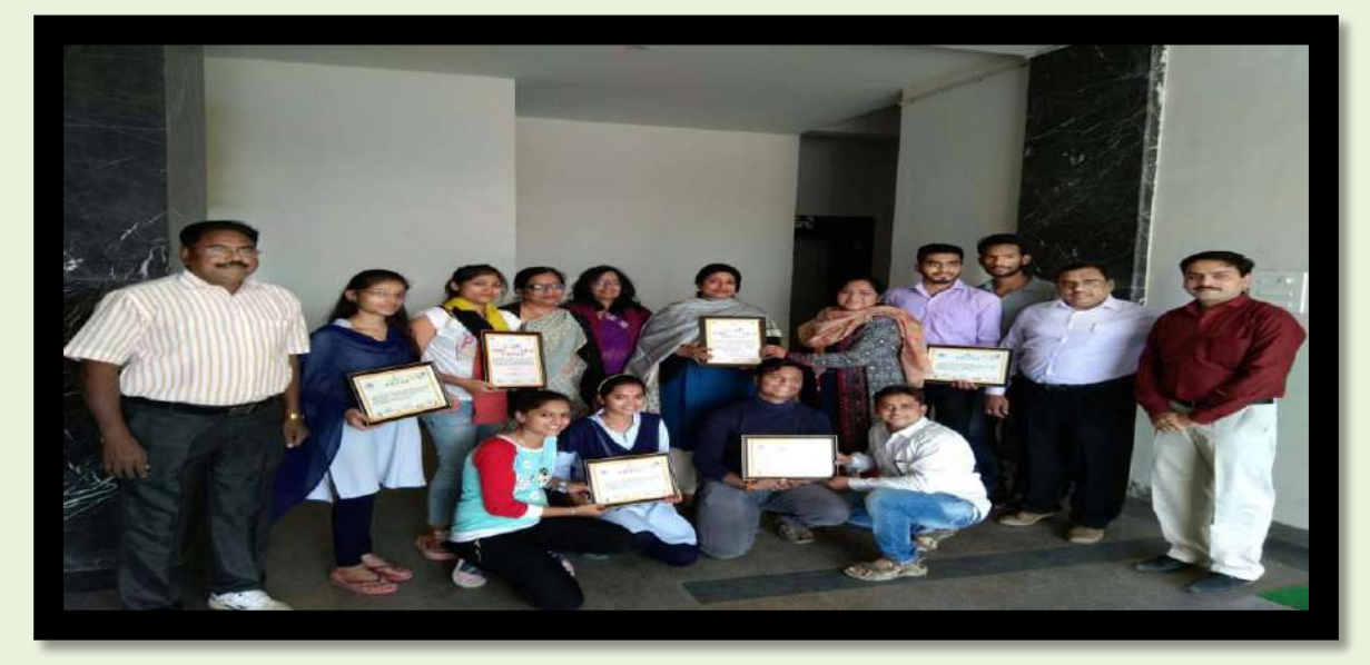
Rangavaikhari Team with GEMS Chairperson & Other Members of GEMS

Rangavaikhari Team Performing the Play "Hechi Daan Dega Deva"