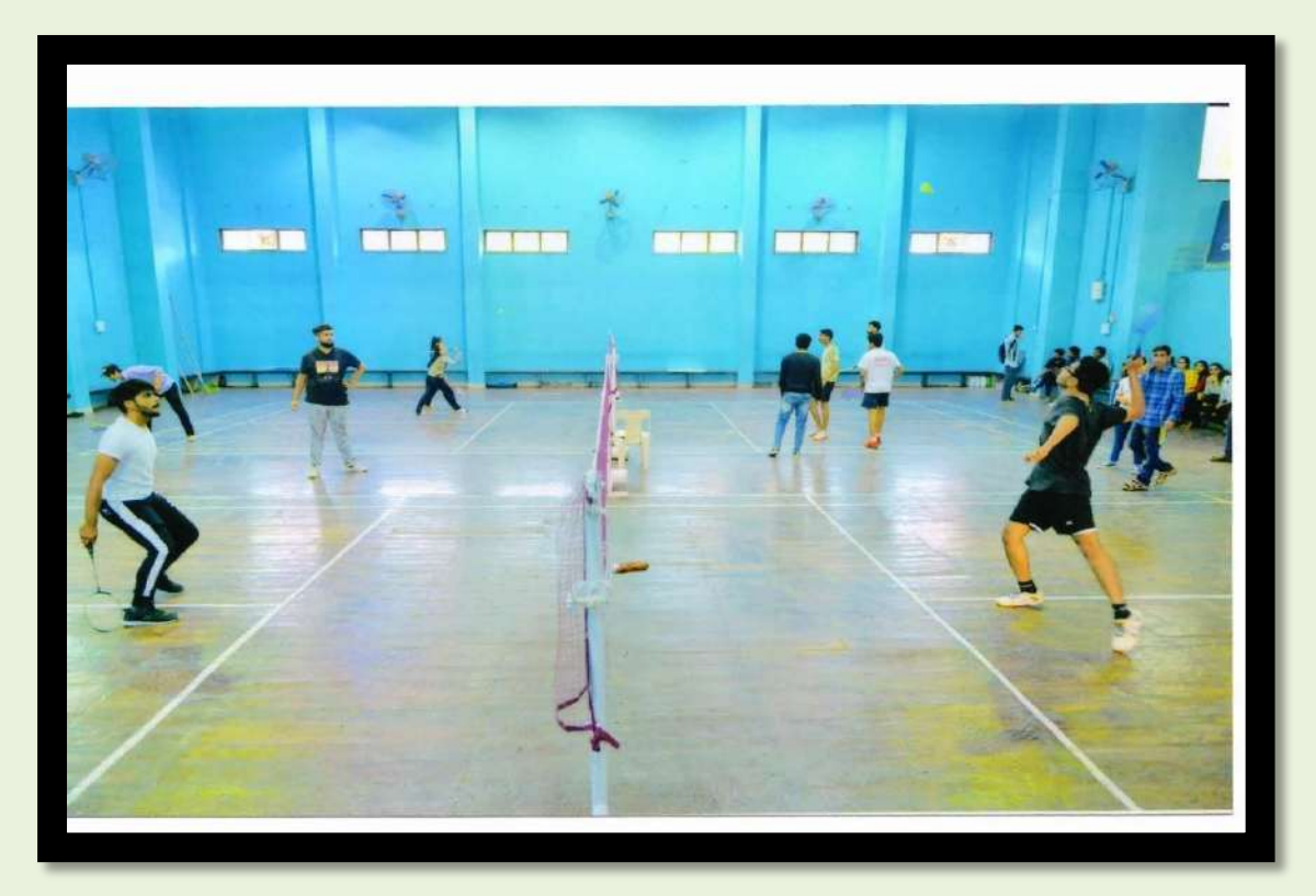
Badminton Tournament Men and Women