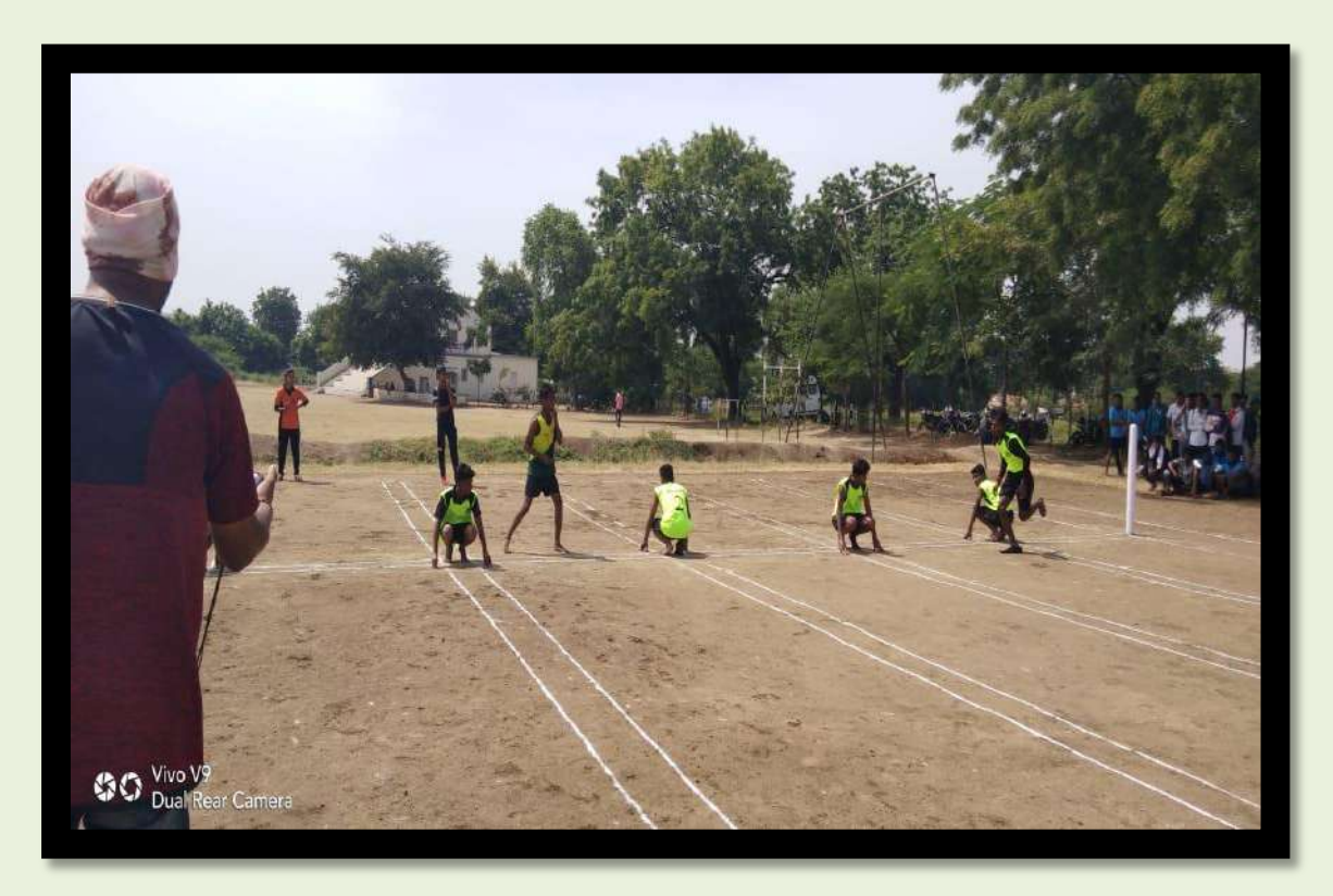
First Match of the Tournament Between V.B.M.V. Vs Bhartiya Mahavidyalaya