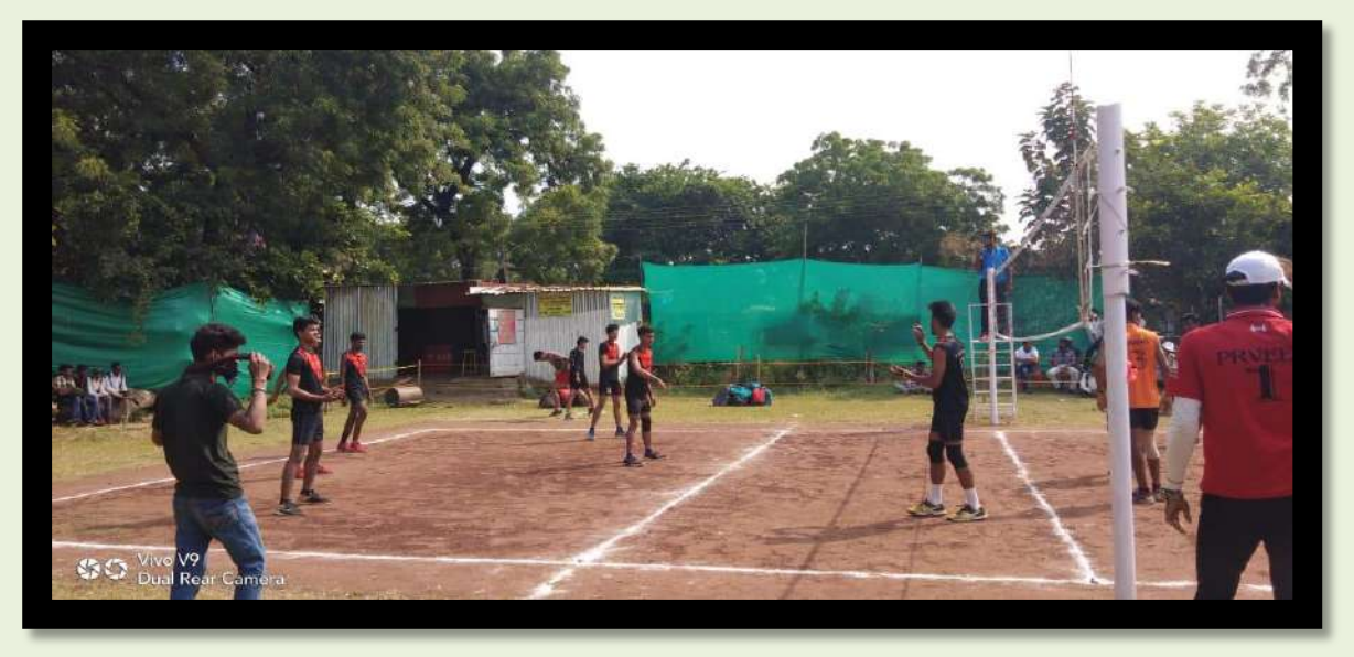
Quarter final M Inter Collegiate Volleyball Tournament