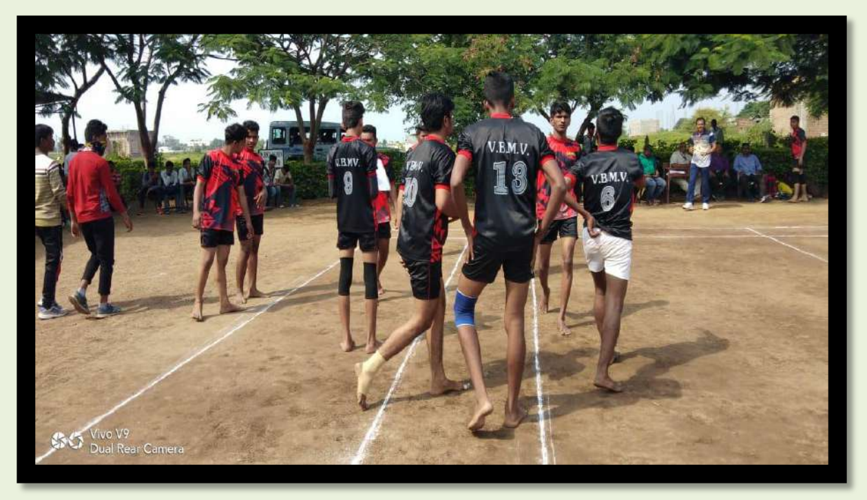
Inter Collegiate Kabaadi Tournament Semi-Final Match