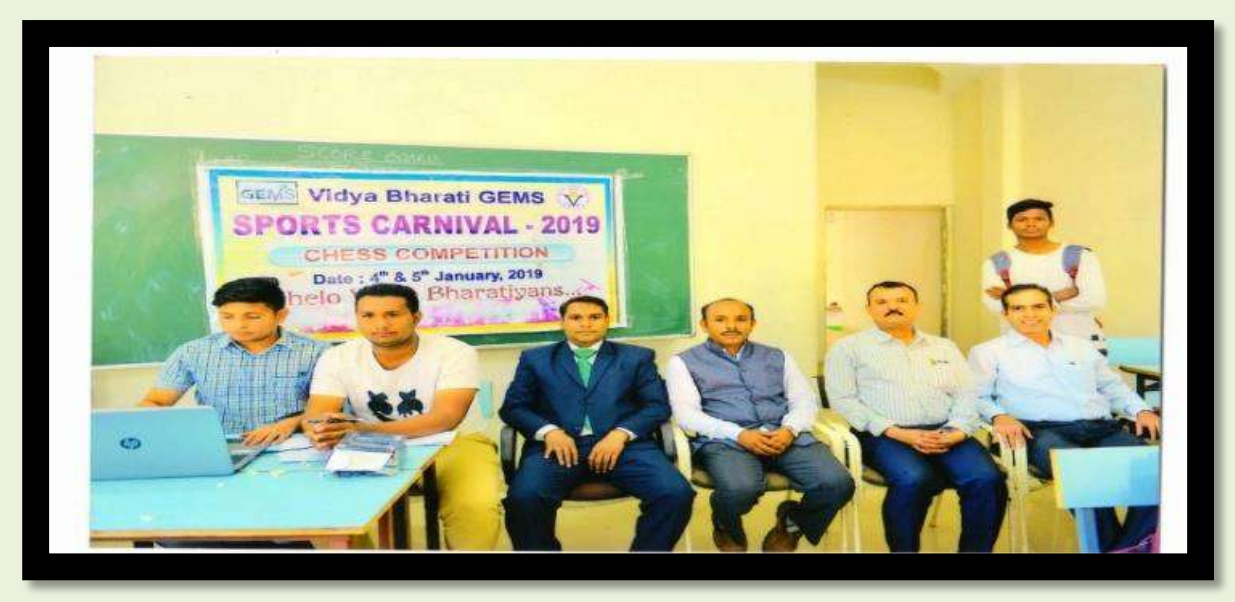
Judges and Umpire of the Chess Competition

Total 5 students represented our college team in the Inter Collegiate tournament under S.G.B.A.U. which was held on 05/09/2018 to 10/09/2018 at Smt. Kesharbai Lahoti Mahavidyalaya, Amravati.