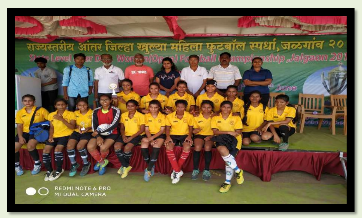
W. I. F. A. Football Tournament Team