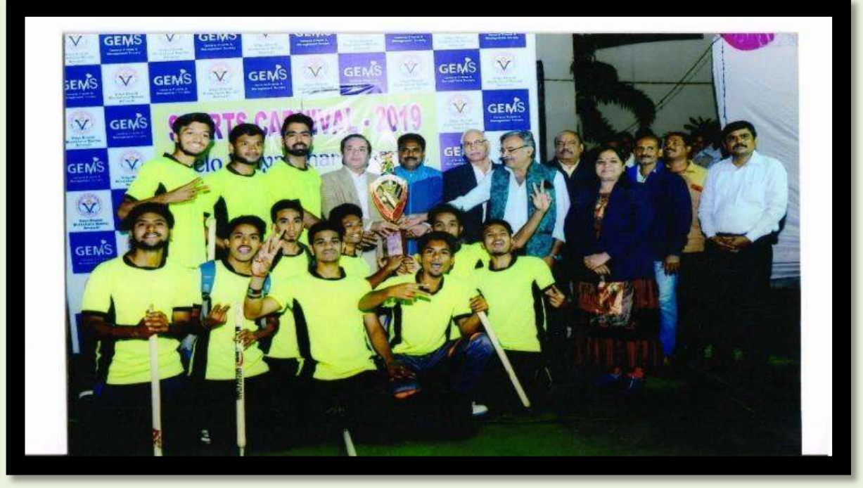
Winner Team being felicitated by Hon`ble Shri. RaoSaheb Shekhawat