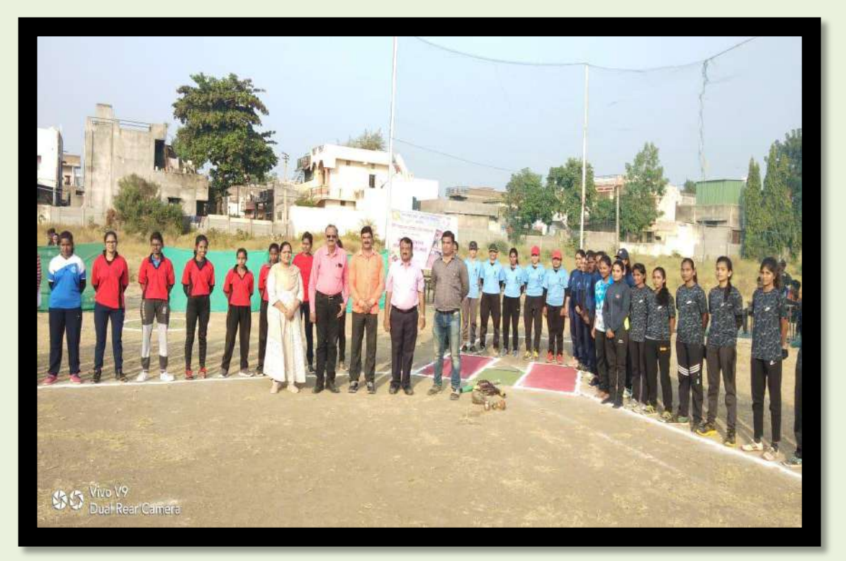
Opening Ceremony of Softball (Women) Inter Collegiate Tournament

Total 11 students were participated in the Inter Collegiate tournament which was held from 07/12/2018 to 11/12/2018 at Prof. Ram Meghe Institution of Technology and Research, Badnera.