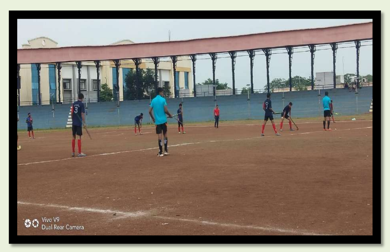
Inter collegiate Hockey Tournament- Final Match Between V.B.M.V. Vs Smt. K. L. College