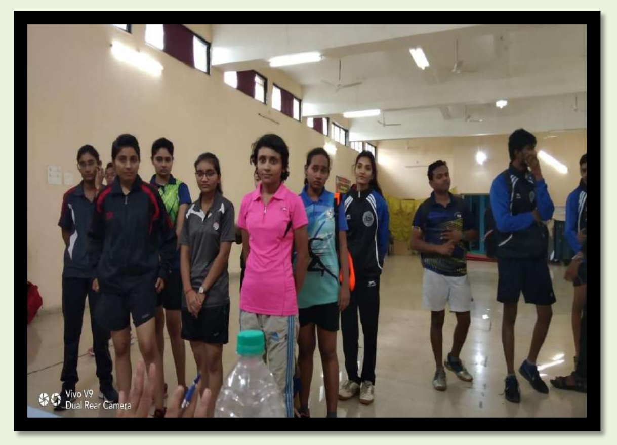
Students Participants of Other Colleges