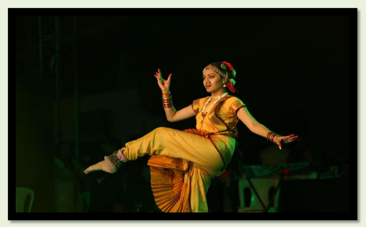
Student performing in Solo Dance Competition