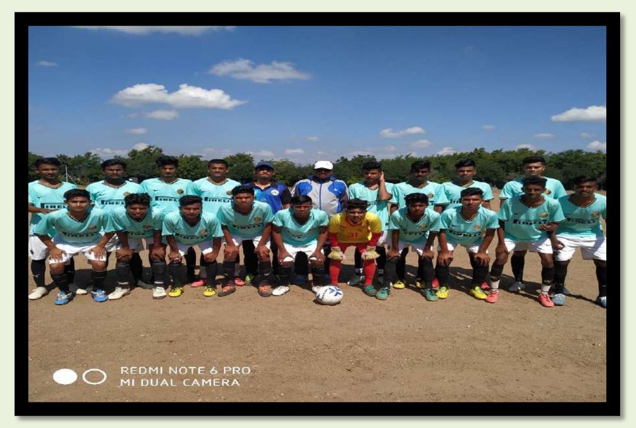
Inter Collegiate Football Team