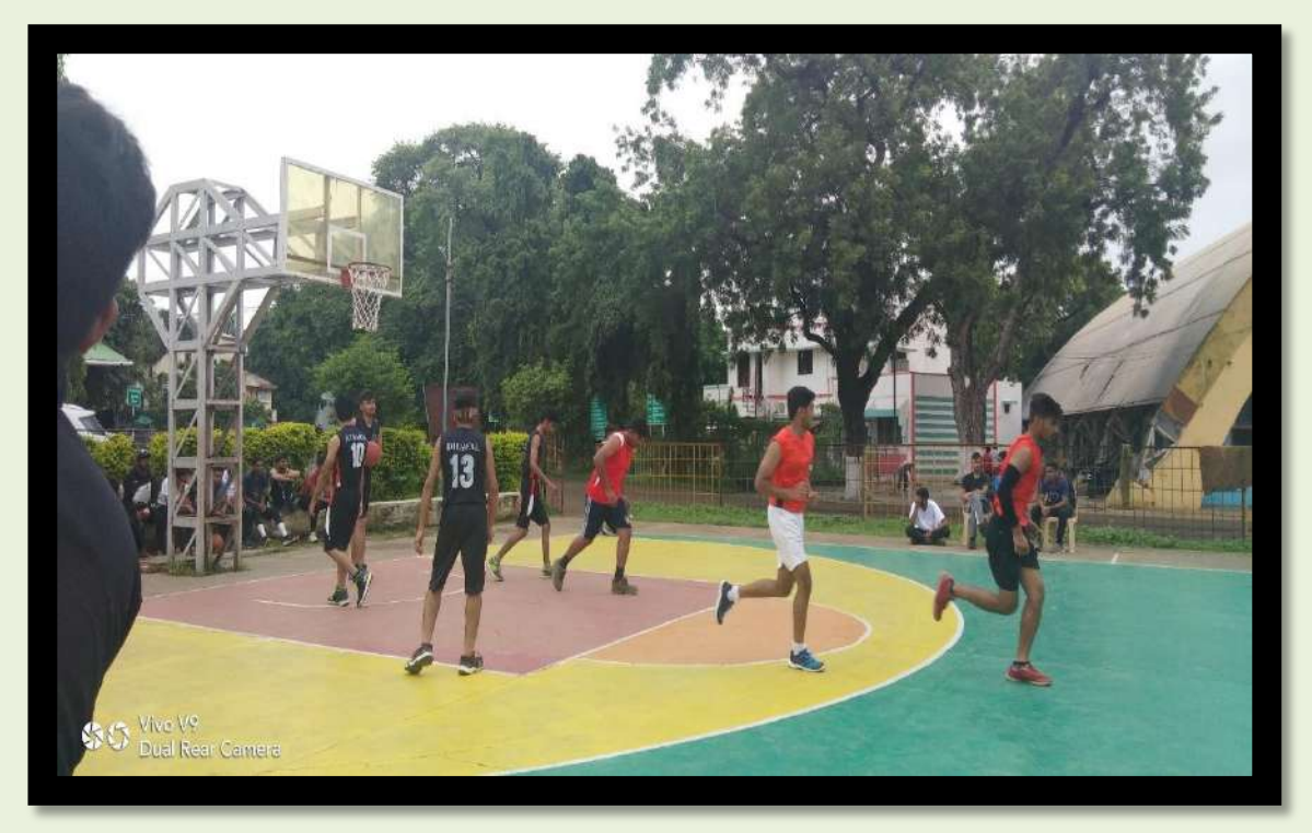
Inter collegiate Basketball Tournament- Free Quarter Final Match