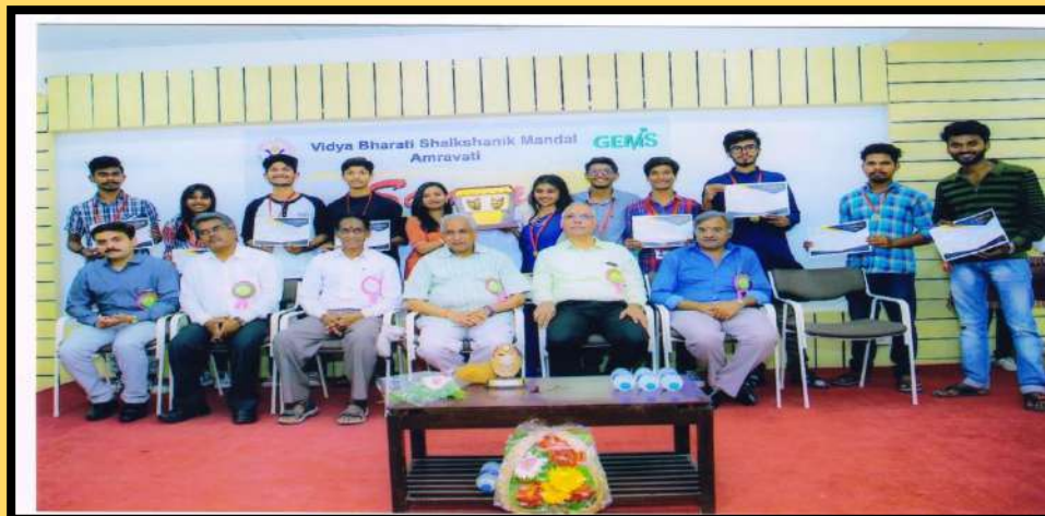
Purushottam Karandak Team Secured 2 nd Place in State Level Competition