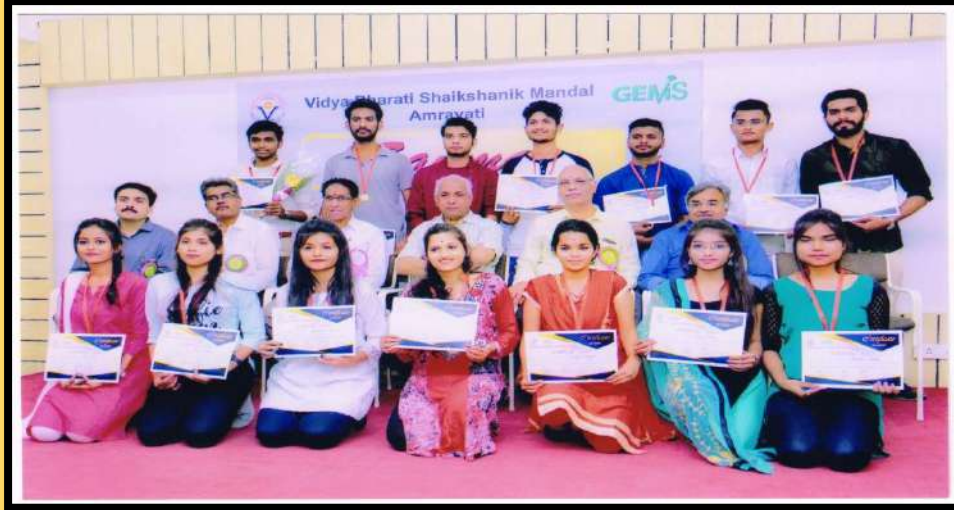
Rangavaikhari Team Secured 2 nd Place in State Level Competition