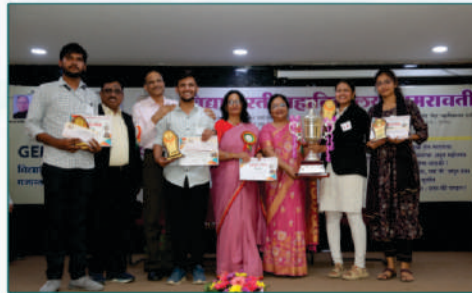
Winners of State Level Elocution Competition 2025 proudly display their trophies & certificates alongside esteemed dignitaries