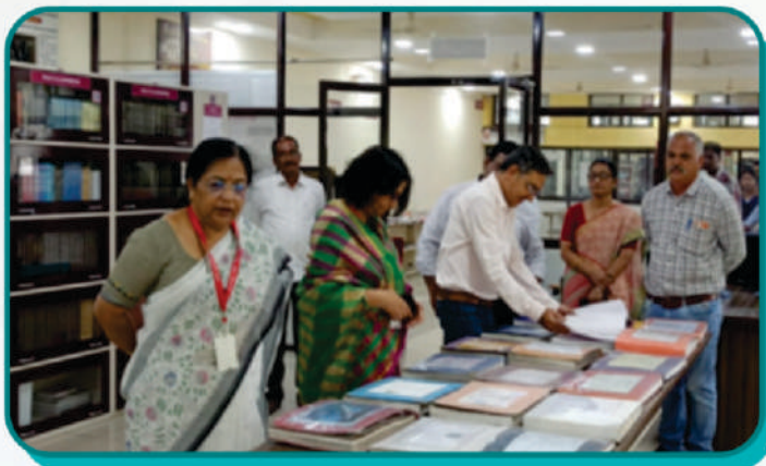
Exhibition of Library Books A curated showcase of knowledge and creativity