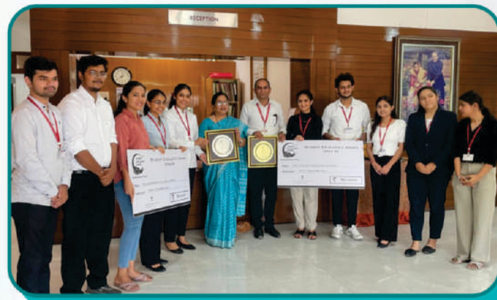
Hair care Team won "I" Prize Position with a cash prize of 50 K & Skin Care Team Won "II" Prize Position with a cash prize of 30 K in A State Level Competition held at Vimal Life Science Ltd. NESCO Goregaon, Mumbai.