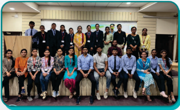
Soft Skill Development Workshop Movie Mania Activity