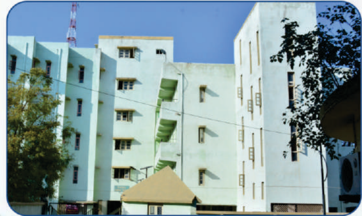
Pratibha Women's Hostel