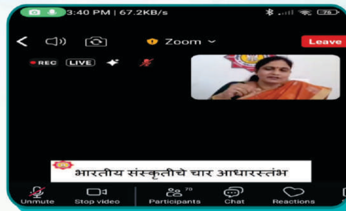
NEP 2020 Orientation & Sensitization Programme under UGC's Malaviya Mission Teacher Training Programme (MM-TTP)