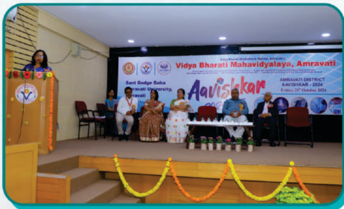
Inauguration of AVISHKAR – Amravati Division, SGBAU: Showcasing Innovation, Research & Creativity