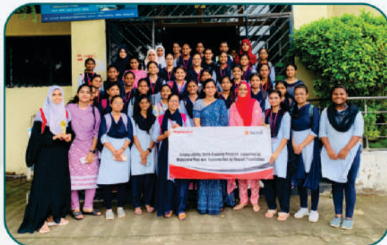
One-Week Employability Skills Training Program for girls by Mahindra Rise, Implemented by Nandi Foundation

Three B.Tech. Cosmetology students have been selected for an online internship program with Hilltop, Tokyo, Japan.