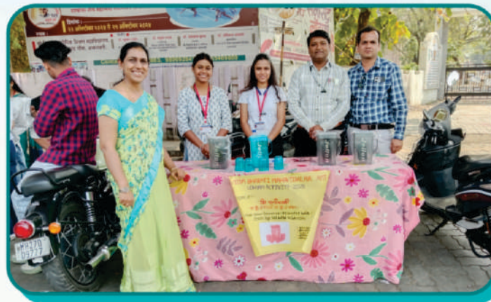
Entrepreneurship Activity: UDHYAM Explore Your Business Fundamentals