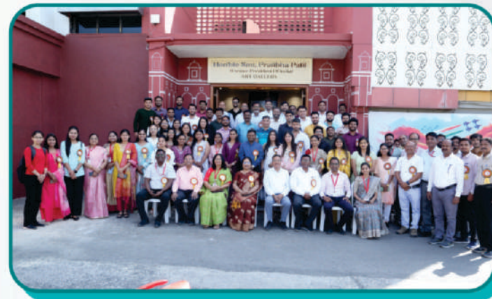
Alumni Meet 2024-25 A heartwarming gathering of past and present, as our eminent alumni reconnect to share their experiences, memories, and valuable insights with the next generation of students