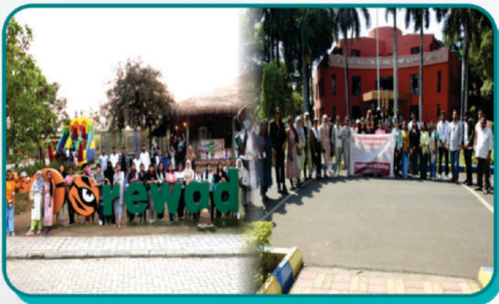
One Day Study Tour to Gorewada National Park & Raman Science Centre, Nagpur organized by Enviro- Club