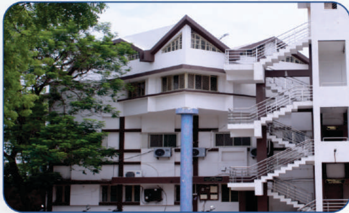
Head Office : Vidya Bharati Shaikshanik Mandal, Amravati