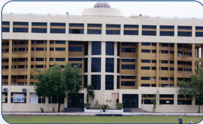
Wing : Self Finance Programmes