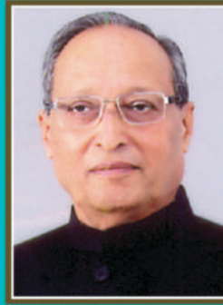
Late Hon'ble Dr. D. R. Shekhawat

First Lady President of India Former President Vidya Bharati Shaikshanik Mandal, Amravati.