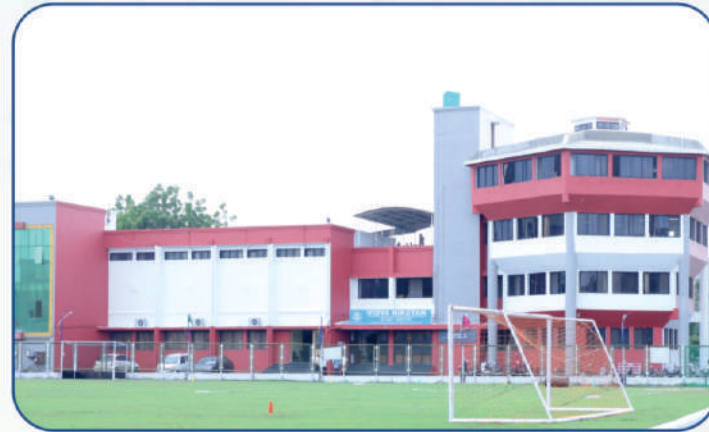
Yoga Hall, Sports Complex & Vidya Niketan Study Centre