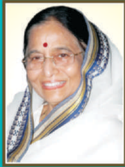
Hon'ble Smt. Pratibhatai Patil

First Lady President of India Former President Vidya Bharati Shaikshanik Mandal, Amravati.