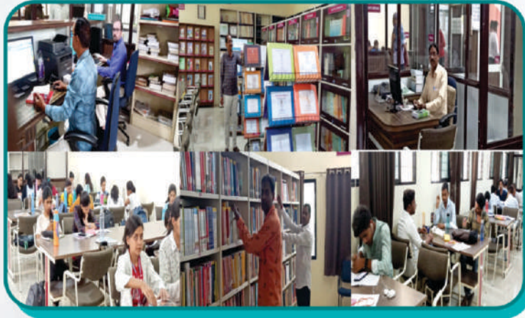
Library, Reading Hall & Browsing Centre