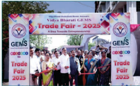
A Vibrant Trade Fair Experience to enhance entrepreneurial skills