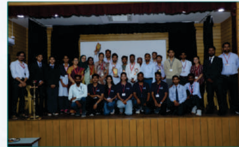
Quiz Competition 2025 Winners – Celebrating Sharp Minds and Quick Thinking