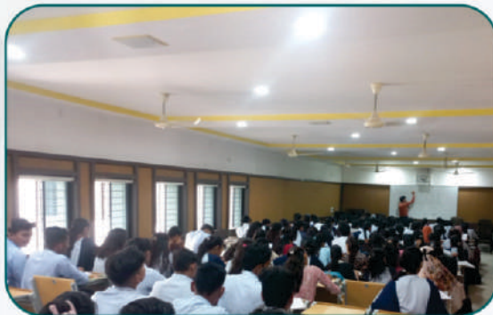
One-Month Certificate Course in Aptitude and Soft Skill Training Organized by the Training and Placement Cell, for equipping participants with vital skills for success