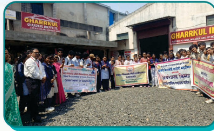
Industrial Visit to Gharkul Masale in MIDC Amravati The heart of local agro-processing, packaging, and rural entrepreneurship.