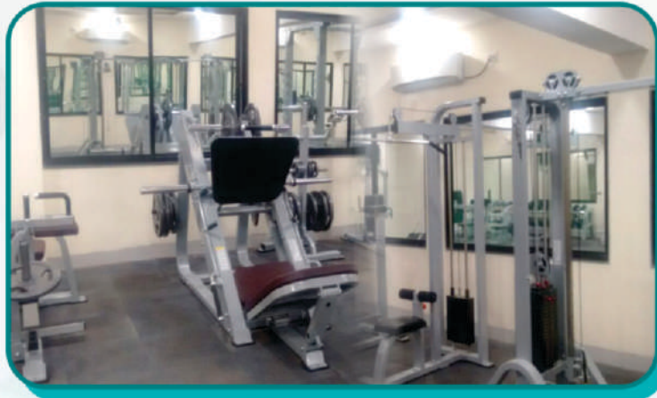
Gymnasium of V. B. S. M.