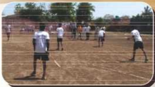
Inter-Collegiate Ball Badminton