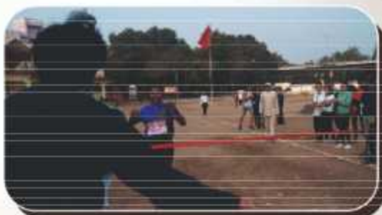
Inter-Collegiate Cross Country M. W. Championship