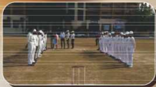
Inter-Collegiate Cricket Women Tournament