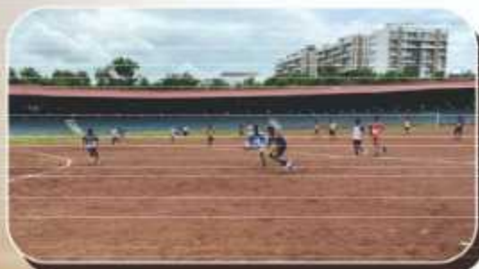
Inter-Collegiate Hockey Men Selection Trials