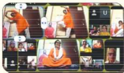
Online Regular Yoga Class for Society