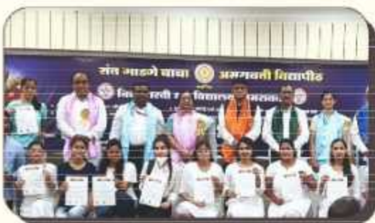
Our Meritorious Students