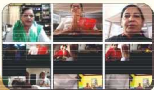
Online Training and Guest Lecture on Fitness Medical Yoga