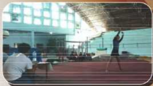
Inter-Collegiate Gymnastics Competition