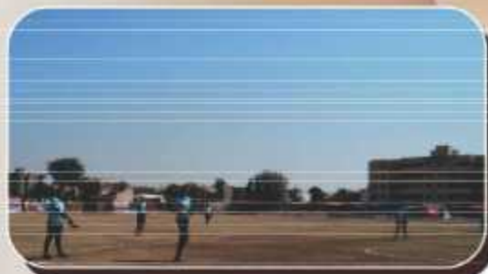
Inter-Collegiate Softball Women Tournament