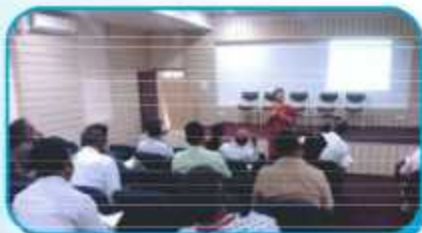
Workshop for Non-Teaching Staff on Professional Ethics & Work Culture