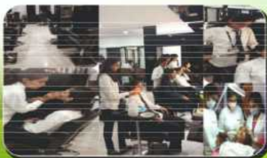
Dept. of Cosmetic Technology Workshop on Beauty & Spa Therapy Technique