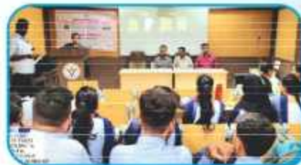
One Week Workshop on NET & SET