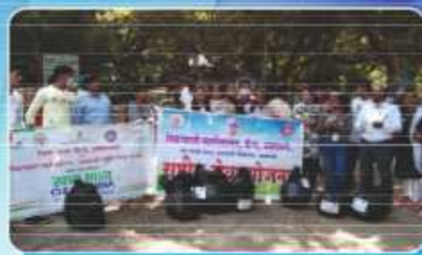
Awareness Drive: Ban on Plastic & Collection of Waste in Collaboration with Nehru Yuva Kendra, Amravati Centre