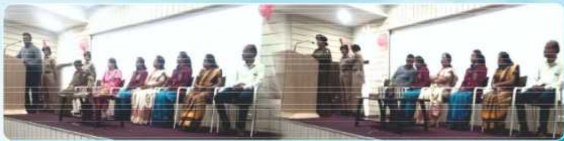
Felicitation Programme of NCC Cadets participated in RD Parade at New Delhi