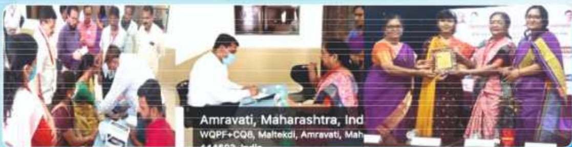
Amravati, Maharashtra, India WQPF+CQ8, Maltekdi, Amravati, Mah 445603, India