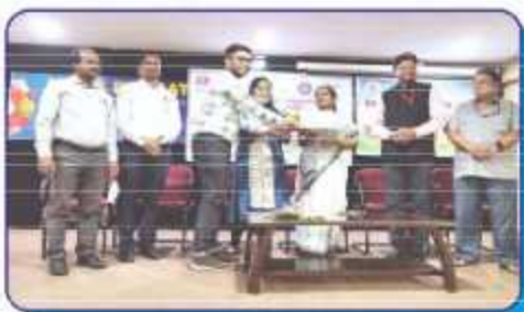
The Winner of the District Level Debate Competition in Collaboration with Nehru Yuva Kendra, Amravati Centre