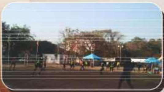
Inter-Collegiate Handball Tournament