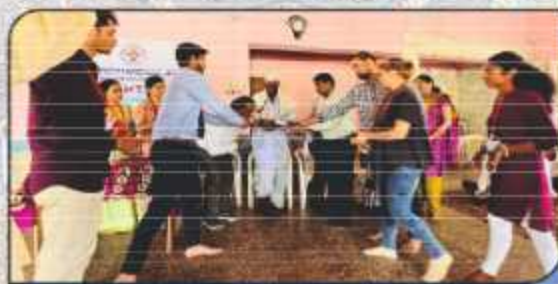
Visit to Matoshree Old Age Home