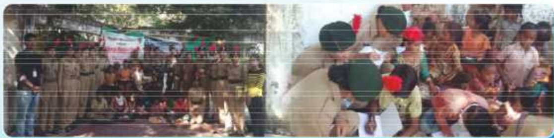
Distribution of Study Materials and Snacks to Economically Poor Kids Studying under SARE Foundation