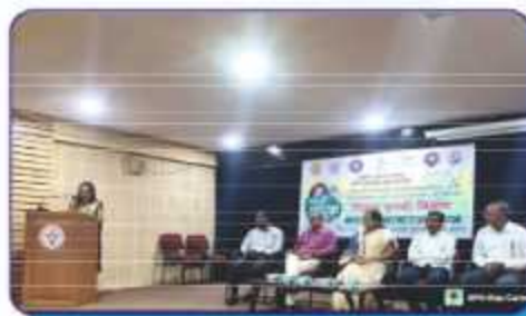
Celebration of World Earth Day in collaboration with Nehru Yuva Kendra, Amravati Centre