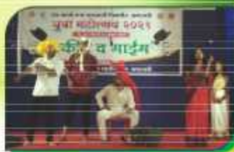
One Act Play