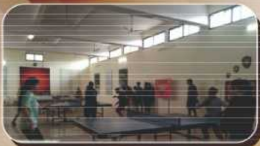
Inter-Collegiate Table tennis (M. W.)