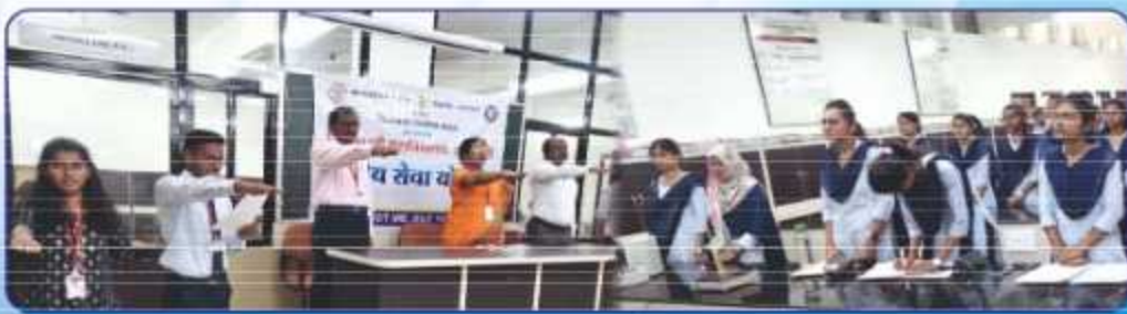
Oath taking on World Water Day to Promote the Responsible Use of Water & Access to Safe Water for Everyone