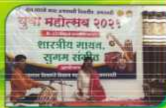
Indian Classical Solo